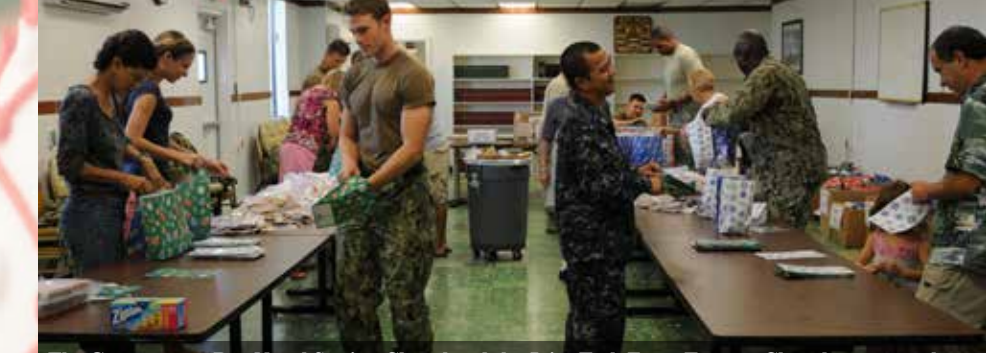
The Guantanamo Bay Naval Station Chapel and the Joint Task Force Trooper Chapel come together with volunteers in order to package cookies being distributed to around 1,100 civilians and Troopers alike who will be on duty both Christmas Eve and Christmas Day.

some sort of duty," said Navy Lt. Tung camps, there are a lot more fun places to be on Christmas Day.'