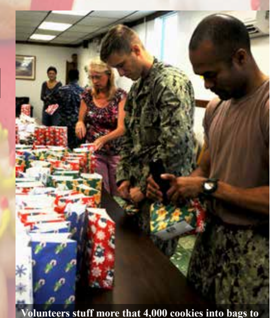
Volunteers stuff more that 4,000 cookies into bags to be handed out on Christmas Eve and Christmas Day

"For the many people that will work on Christmas Eve and Christmas Day, this will hopefully bring a little cheer to them," Zulli