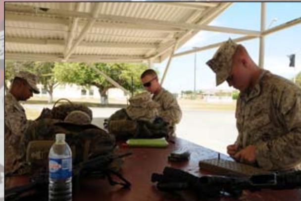
Marines inspect their gear and count ammunition after coming off duty, Aug. 16.