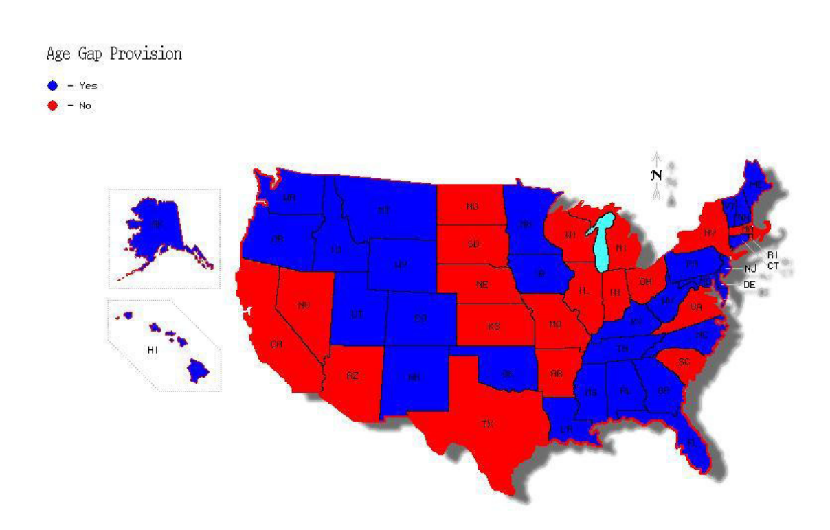
Figure 2. States with Age Gap Provisions

Many other states have also included these age gap provisions into their existing laws in order to differentiate cases of young persons in close-in-age relationships. In fact, the majority of states currently have some form of an age gap provision in their statutory rape laws according to the U.S. Age of Consent Chart (Figure 2).<sup>10</sup>