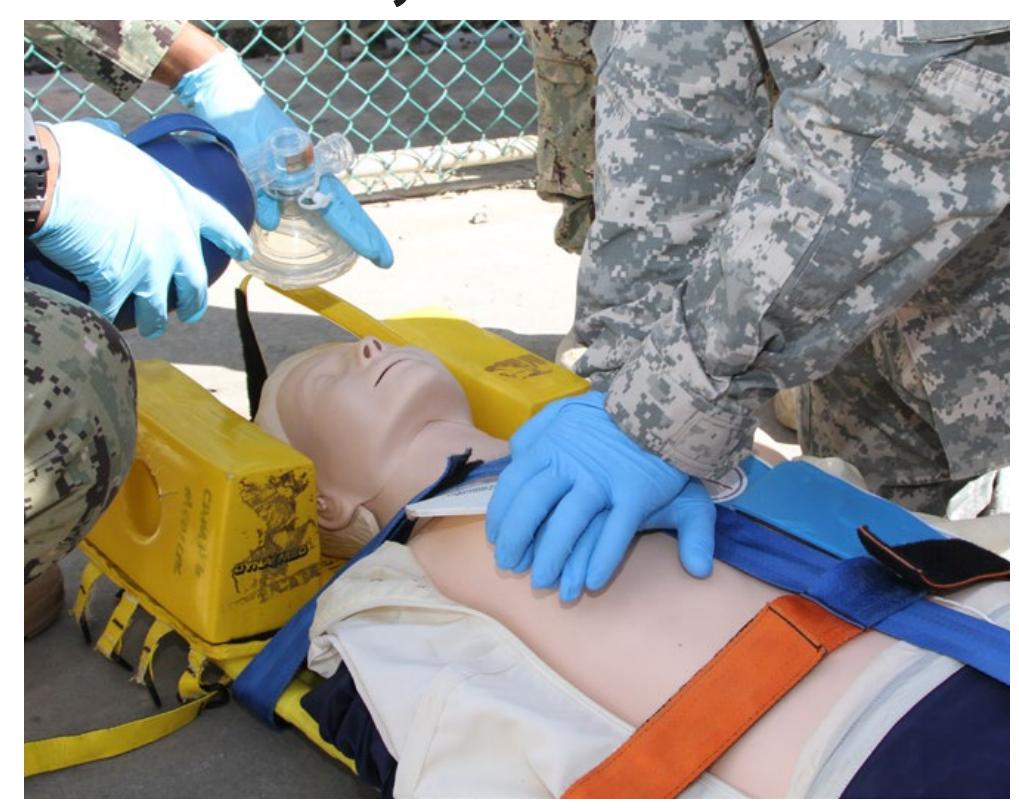
Medical personnel perform CPR on a mannequin while waiting for an ambulance to arrive. During the waiting process, guards had the opportunity to practice and ask questions about ways to correctly perform CPR.

A guard walks up and down an empty cellblock in the detention facility, waiting for the trainers to say the practice scenario has begun. Once the goahead is given, the call for back-up is made and medical personnel rush into the block ready for whatever medical emergency that is about to be thrown at them.