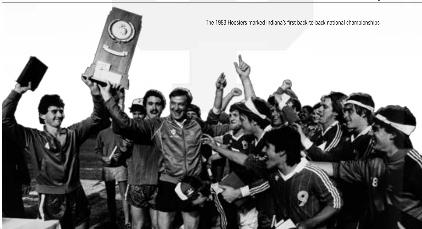
The 1983 Hoosiers marked Indiana's first back-to-back national championships