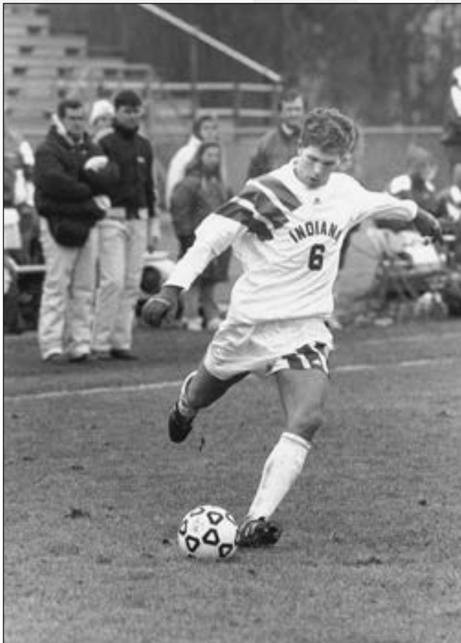
Todd Yeagley's four assists against Northwestern in 1991 is still tied for Indiana's single-game record.