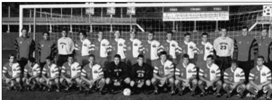
The 1997 team won 23-straight games and scored 83 goals.