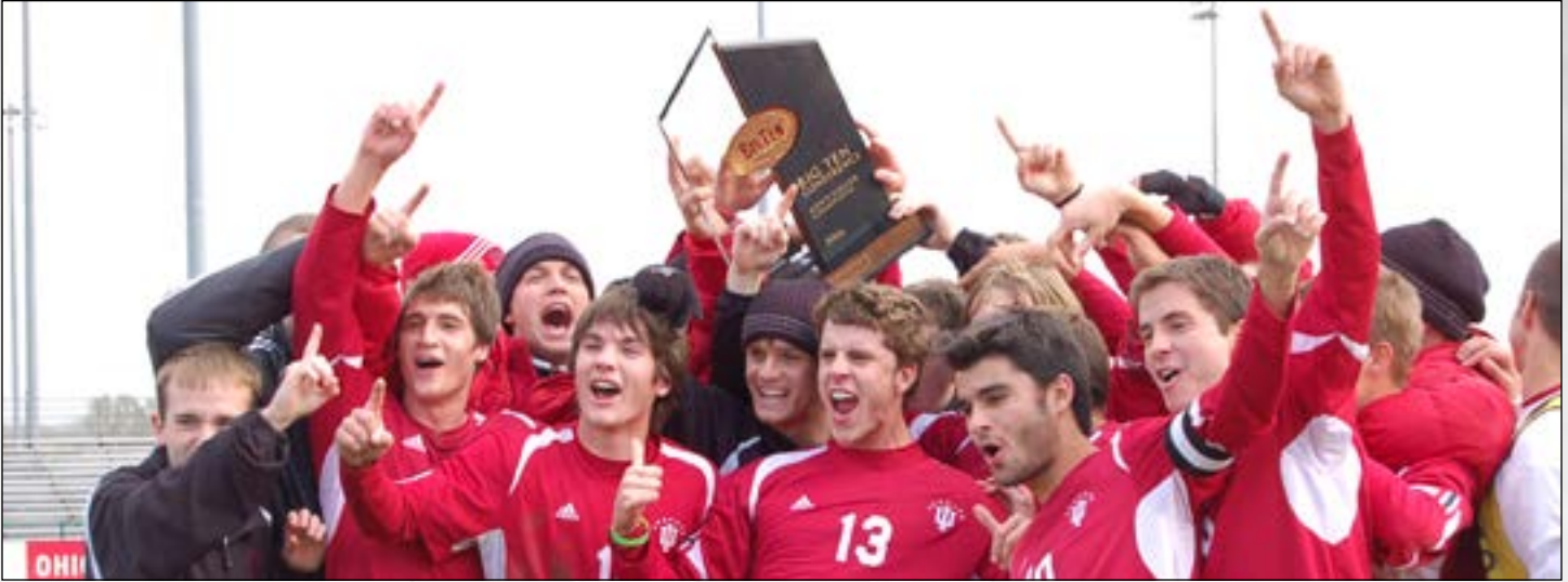
Indiana has won a league-best 11 Big Ten Tournament titles, taking home the crown in 1991, 1992, 1994, 1995, 1996, 1997, 1998, 1999, 2001, 2003 and 2006.