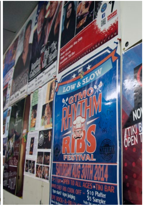
The walls of the "Music Room" facility for MWR production equipment, are lined with promo-posters from past events and tours hosted here.

With entertainment outlets making proposals to the largest venue in a region to determine the