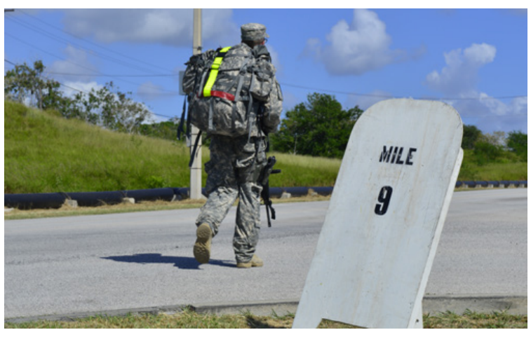
A Soldier with the 525th Military Police Battalion, passes the ninth mile marker during a 10-mile ruck march on Dec. 22-23.