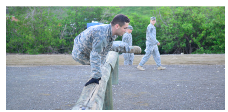
A Soldier with the 525th Military Police Battalion completes an obstacle course at U.S. Naval Station Guantanamo Bay, Cuba on Dec. 22-23, as part of the Best Warrior Competition.

The Soldiers of the 525th Military Police Battalion defined "warrior" during their Best Warrior Competition at U.S. Naval Station Guantanamo Bay, Cuba on Dec. 22-23.