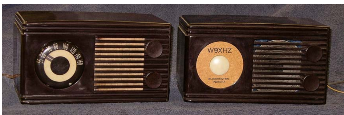
Unbranded Maguire (Model 500) side-by-side with Sarkes Tarzian radio.