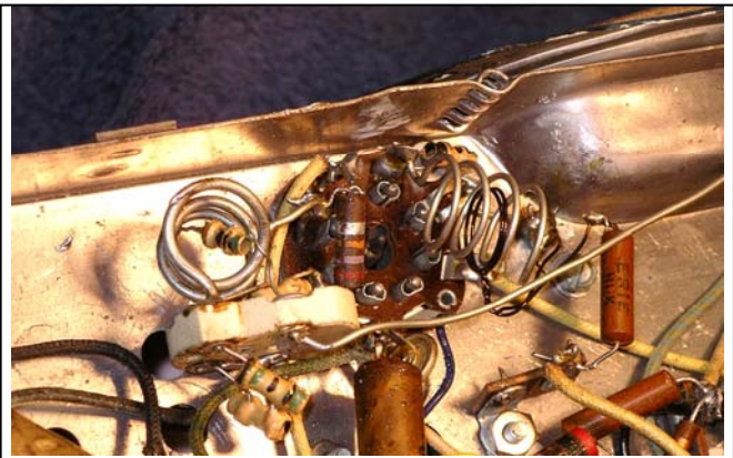
This is the 12SA7 region of the under-chassis. Note the VHF coils, fixed ceramic tuning caps, and the antenna coupling link in the middle of the RF coil (on the right). The oscillator coil (on the left) is mounted on a porcelain insulator from a WW2 surplus variable capacitor.