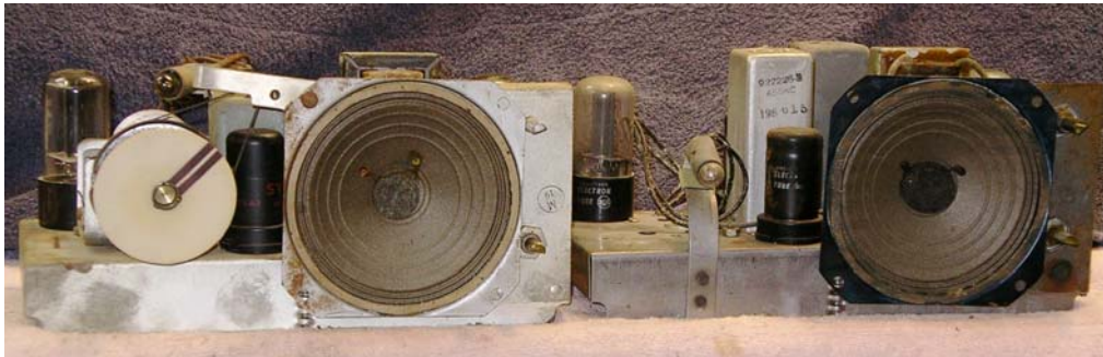
Unbranded Maguire (Model 500) chassis side-by-side with Sarkes Tarzian.