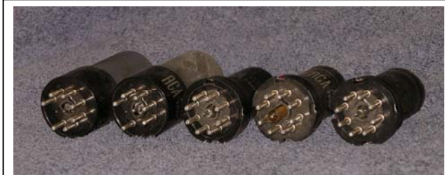
An All-American five lineup, but not an octal base key in the lot. Every tube had the base key broken off, and one tube (and all the sockets) had red dots for insertion guides.

designed for 50 Mc. For example, the Stromberg-Carlson 425H and 505H use a 6SA7 converter and a 4.3 Mc IF. Getting the 12SA7 to convert at 88 Mc is a bit more tricky, but obviously doable. The Maguire was probably chosen for a number of reasons. Perhaps one was its similarity to earlier FM designs.