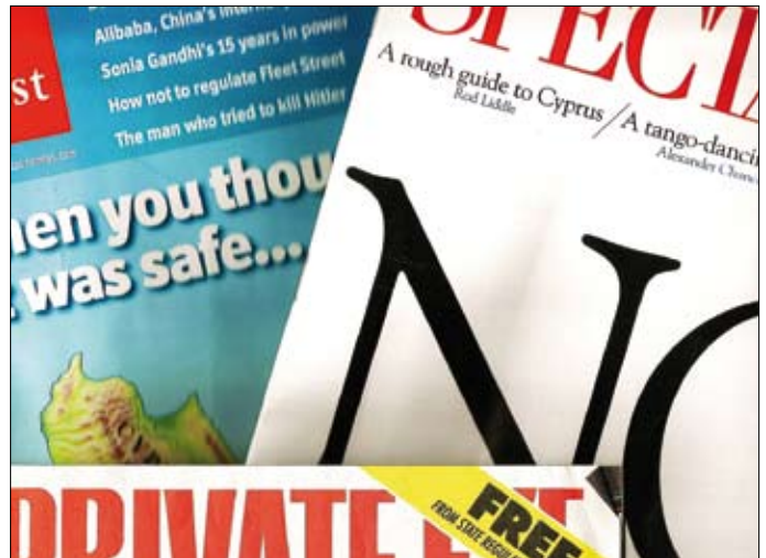
Refuseniks: leading the editorial opposition to state regulation

MPs must consider the long-term effects on our