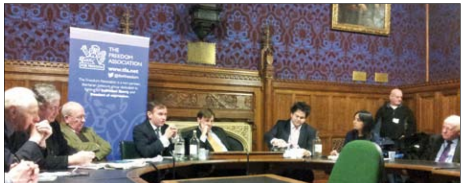
The Freedom Association's recent meeting on Freedom of the Press which was attended by members of the Chartered Institute of Journalists.

It is something we have cultivated over centuries. Let's not give it up so easily citing the deplorable actions of a minority group within the industry, before fully exploring alternative ways of addressing its shortcomings.