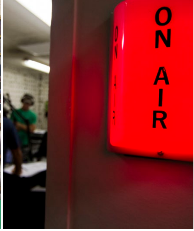
Island Country airs Wednesday nights from 6 to 9 p.m. and features country music and segments tailored to GTMO personnel.

gaming controller available to consumers that inflicts actual pain during game play.