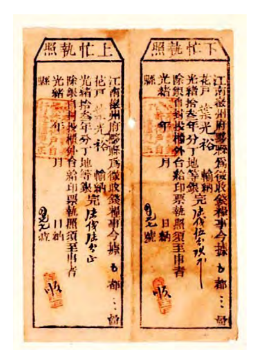
Demand Note for Agricultural Tax Anhui Late 19th Century 24 (L) 16.6 (W) cm

Block printing was used to produce official documents – land certificates, census records, revenue collection records and many others, which were then signed and chopped by the responsible departments, as well as land transfer certificates, which helped make the process of buying and selling land easier. Also during this time, as commerce began to develop to an unprecedented extent, account books, transaction receipts, trading rules, advertisements and product labels were all block-printed to facilitate business activities.