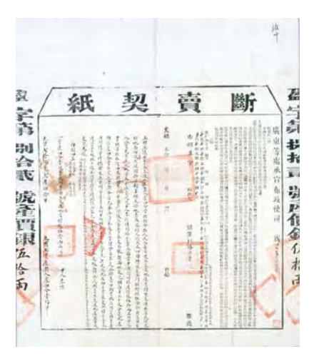
Land Transfer Certificate Guangdong The 29th year of Guang Xu , Qing Dynasty (1903) 68 (L) 57.5 (W) cm

The private selling of land was very common during the Qing Dynasty. After each transaction, the government would issue a certificate to certify ownership.