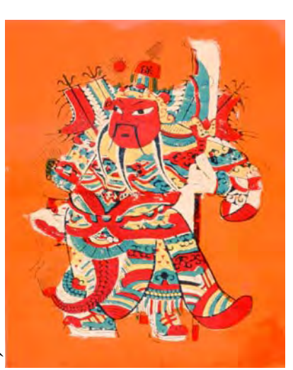
Woodblocks and Prints of Military Door Gods, Da Lai Quan Foshan, Guangdong