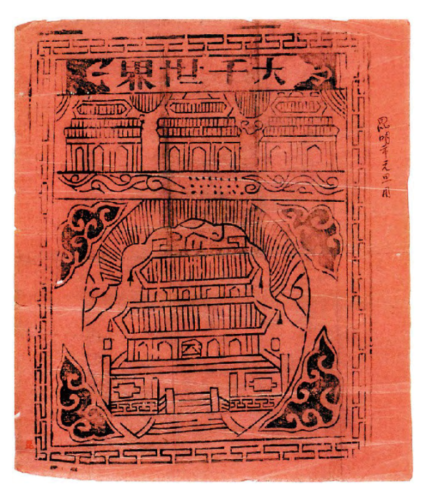
The Boundless Universe Kunming, Yunnan 1950s – 1960s 36.5 (L) 30.7(W) cm

The paper offerings for one's ancestors or for ghosts and spirits are burned in a ritual.