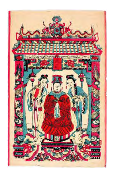
Empress of Heaven Foshan, Guangdong Early 20th Century 56(L) 35(W) cm

The Empress of Heaven was commonly worshipped by people along the coast of China and regarded as the protector of sailors and fishermen.