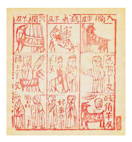
Good Deeds Illustrated on Paper Foshan, Guangdong 1950s – 1970s 18.2(L) 21.5(W) cm

Good Deeds Illustrated on Paper is printed on yellow paper with sketches of mortals and red sheep.