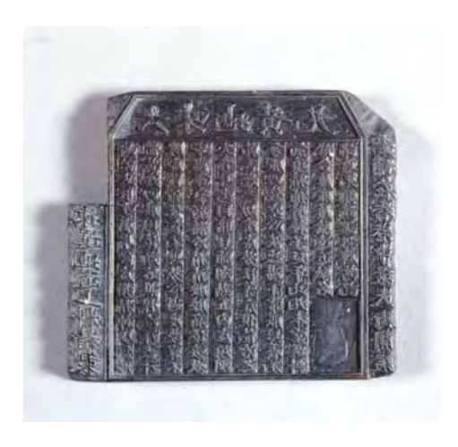
Woodblock for leaflet of Liuwei Dihuang Pills Hong Kong Early 20th Century 17.2 (L) 16.5 (W) 1.3 (H) cm

The product leaflets were commonly printed with woodblocks during the early period of Hong Kong. Here is one of the woodblocks from Cheng Ji Tang , a Chinese Medicine shop in Central.