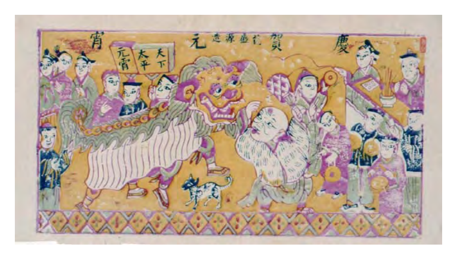
Celebration of Lantern Festival Jiajiang, Sichuan 1950s – 1960s 25.5 (L) 45 (W) cm

The Lantern Festival was a traditional festival in Chinese society and famous for its lantern exhibition.