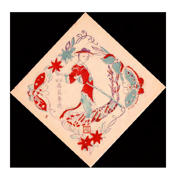
Lantern Picture – Rowing a Boat Hong Kong 1950s – 1970s 15.8 (L) 16 (W) cm