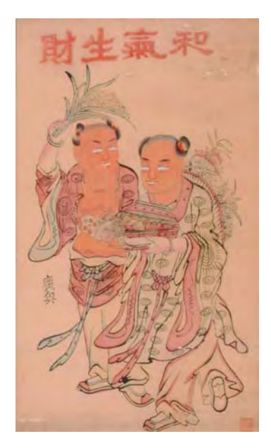
Harmony Brings Wealth Foshan, Guangdong Early 20th Century 57.8 (L) 33.2 (W) cm

Among the numerous designs, some recurrent motifs are flowers and fish. The idea is to invoke blessings of peace and harmony for the New Year.