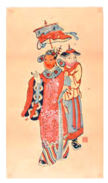
Ranked Number One in Imperial Examination and the Son-Sending Fairy Foshan, Guangdong Early 20th Century 61.9 (L) 35.6 (W) cm

Drawings like this represented hope and a promising future. People usually displayed them on the doors of the room for newly married couples.