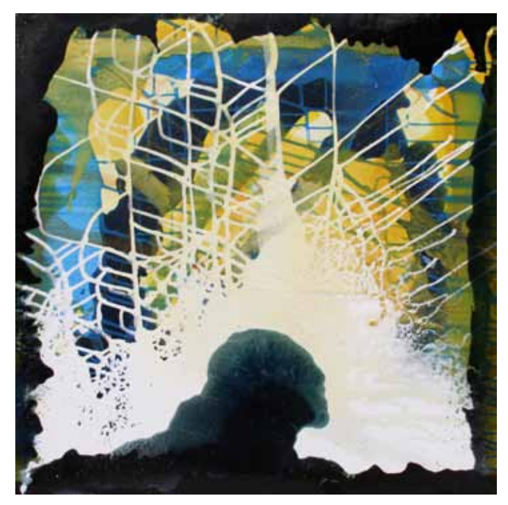
Cuadros Negros 0705 Acrylic on Canvas 39.5" x 39.5"

Friedrich's abstract expressionist paintings are as compelling as they are complex, studies in movement and the massive web of interconnectivity that joins all who exist in this world. Underlying each image is a sense of drama and surrender to chaos even as unseen forces seem to resist and struggle against the very disorder that defines them. Within each composition color, line