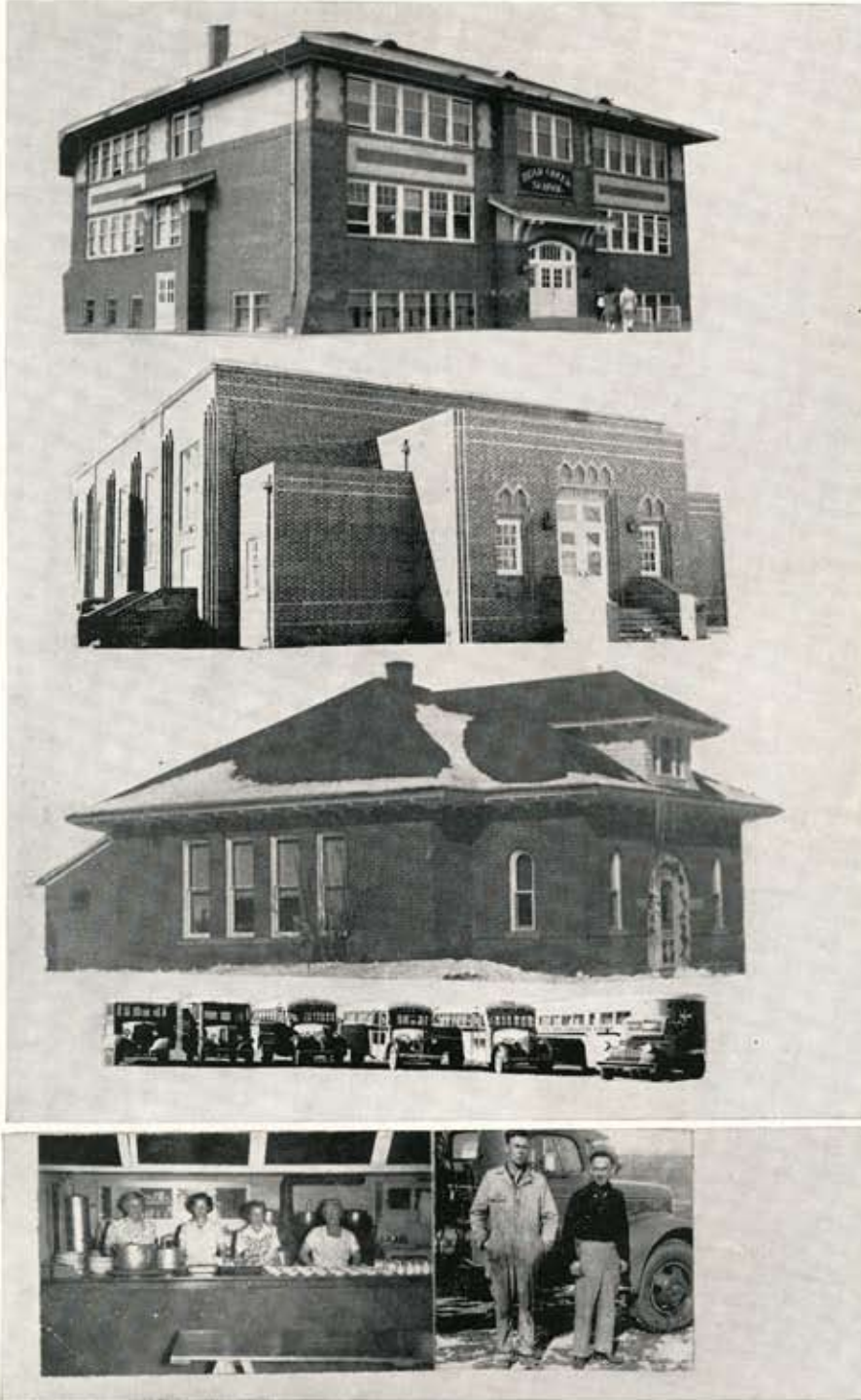
Home of the Bears