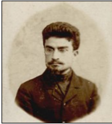
Figure 1: Ivane Beritoff as a student of St. Petersburg University (1910).