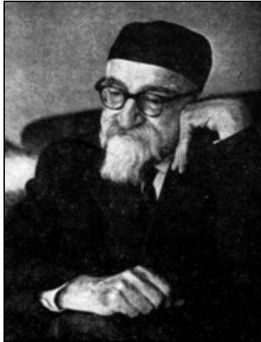
Figure 6: I. Beritashvili, December 18, 1974, 12 days before his death. In his later years he proudly wore the embroidered black felt skull cap characteristic of the Kakhetian people of the east region of Georgia.

birthday. He was buried in the square of Tbilisi State University, alongside the founder of the University, Ivane Javakhishvili.