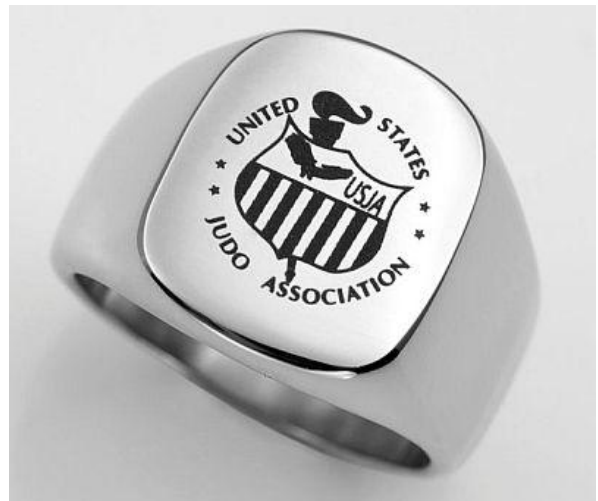
Stainless Steel, solid backed 5/8 X 1/2 inch surface, laser engraved.