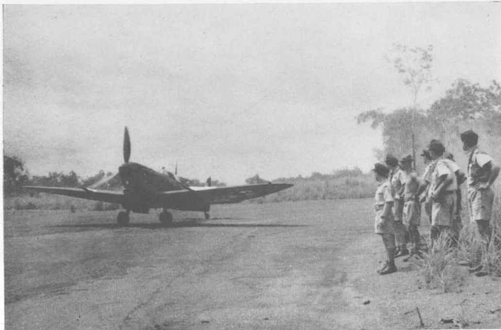
A Spitfire taking off from a Darwin airfield.