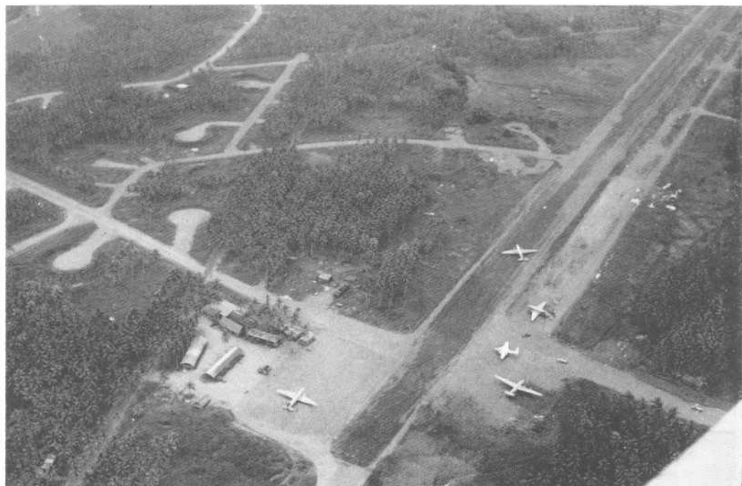
Gurney Airfield at Milne Bay.