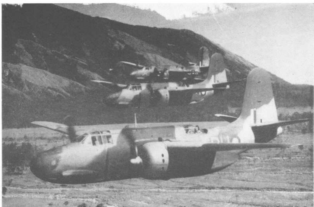
Boston medium bombers of No. 22 Squadron returning to a New Guinea airfield.