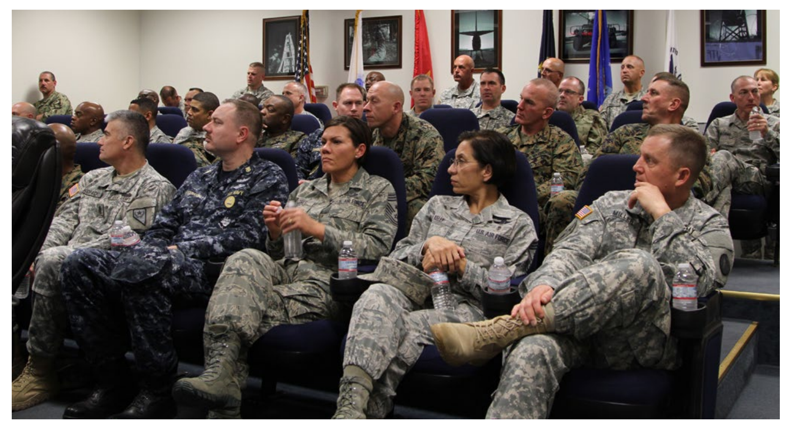
Members of the Keystone Course are shown parts of a detention facility as part of their tour of Joint Task Force Guantanamo Jan. 11. Senior enlisted leaders visited U.S. Naval Station Guantanamo Bay and JTF-GTMO as part of the Keystone Course that partly focuses on the importance of joint operations now, and in the future.

Senior enlisted leaders from throughout the Department of Defense, as well as international partners, visited Joint Task Force Guantanamo Bay Sunday as part of the DOD's Keystone course focusing on joint operations.