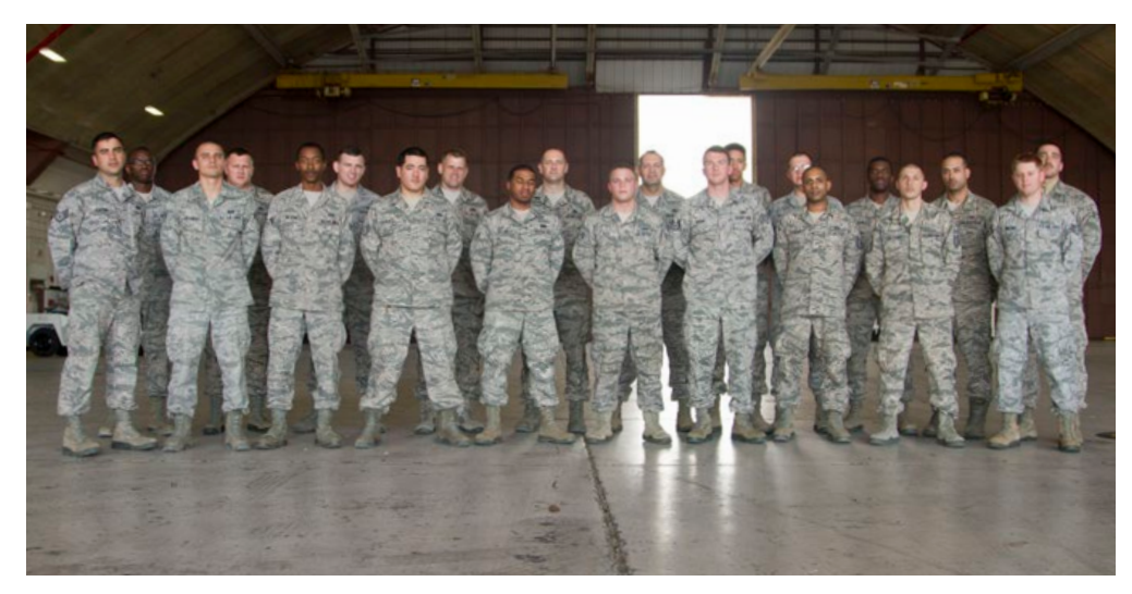
The new Prime BEEF stands together, some for the first time, for a group photo shortly after landing here in Guantanamo Bav. Cuba.

The time has come to say goodbye to our colleagues at the Base Engineering Emergency Force and hello to the new group that came in the first week of January. The new crew is here for a sixmonth tour where they will continue the hard work of their predecessors.