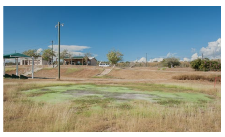
Now called The Lateral Hazard golf course, you can still make out the old green if you look closely.