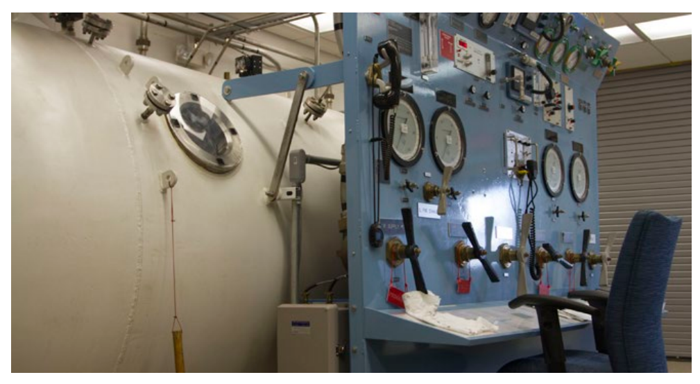
The front panel of the hyperbaric, or decompression, chamber in Guantanamo Bay, Cuba. The chamber is where U.S. Navy Divers treat patients experiencing decompression illness or symptoms.

Decompression illness is serious and should not be taken lightly. Knowing the signs and symptoms and what to do in case they show up is vital. Navy Divers here at U.S. Naval Station Guantanamo Bay have the ability to help treat this issue. There are a lot of divers here, not just from the Naval Station, but from the Joint Task Force as well.