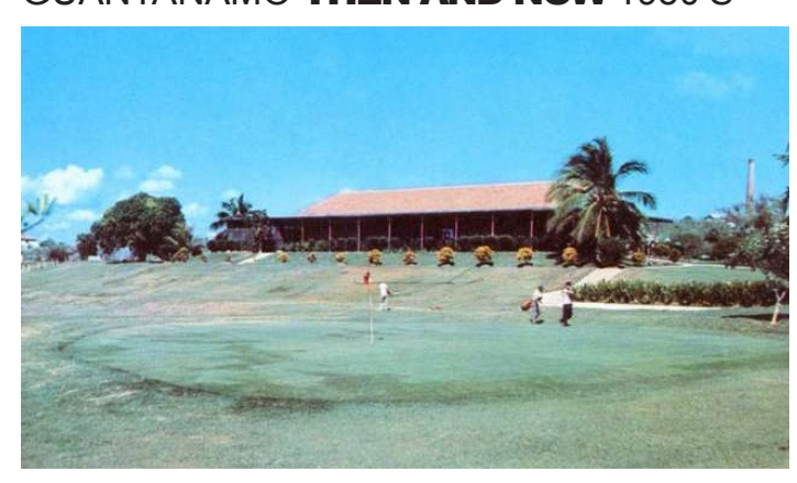
Guantanamo Bay's golf course pictured here in the early 1950's.