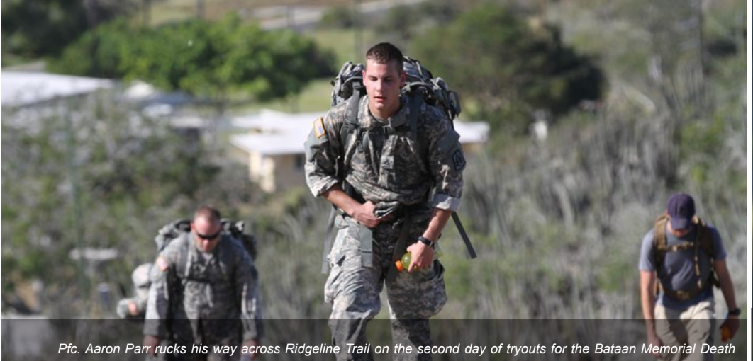
March. Ridgeline trail was one of the many obstacles that participants had to face before reaching the finish line.

Participants took off running once the stop watch was started signifying the beginning to the Bataan Memorial Death March tryouts here, Jan. 8-9. The tryouts consisted of rucking 14.6 miles through various terrain while carrying a 35-pound ruck sack. The top contenders within the 525th MP Battalion will be considered for a position on a five-person team, and will go on to participate in the Death March that will be held in New Mexico this spring.