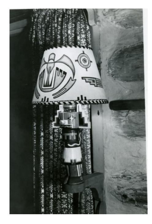
Hunt created the cabin's furnishings