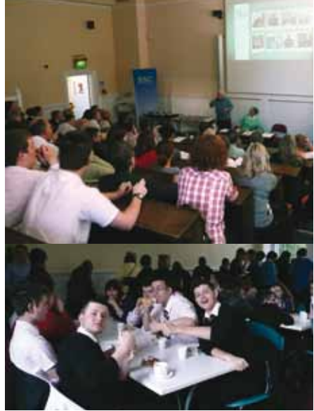
A captive audience and an enthusiastic 'thumbs up' for the DVD from the pupils of ***

As we experienced at the launch of the first DVD, there is a strong sense of community among deaf people and one of the aims of the Heritage Project is to introduce younger deaf people, most of whom nowadays attend mainstream schools, to that culture. In fact the HMIE Report Count me in – Achieving Success for Deaf Pupils mentions that "Deaf pupils (should) have access to specific programmes... such as programmes for learning BSL and awareness of deaf culture." It will be particularly interesting to