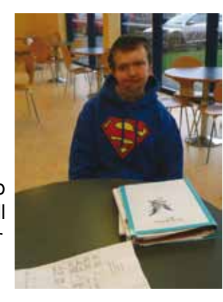
Page 13 | SCoDNEWS

We are so pleased David is doing well and is happy at college. We'd like to wish him all the best for the future.