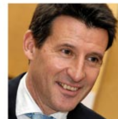
Boris Johnson Mayor of London

I'm delighted to have the opportunity to recognise the role of the British Bangladeshi community in the London 2012 Olympic and Paralympic Games.