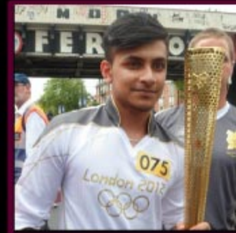
Nahimul Islam - Young Mayor of Tower Hamlets