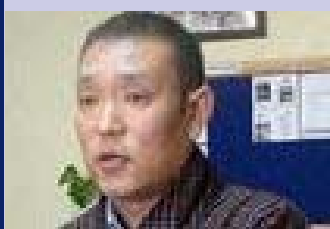
Karma Jurmin Herbal and vegetable packing