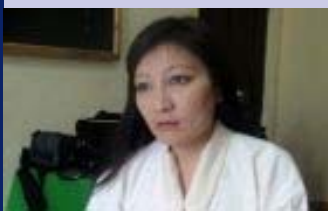
Tashi Choden Children's bookstore