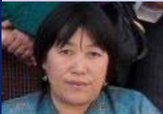
Ugyen Wangmo Weaving centre