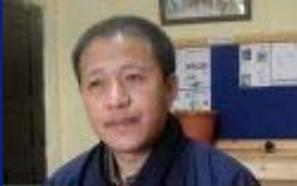
Tsheten Dorji Automobile workshop