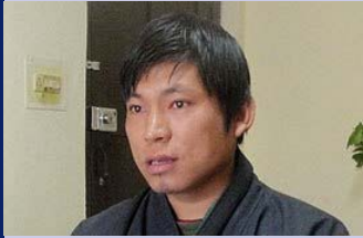
Dorji Gyeltshen Design, tailoring and weaving