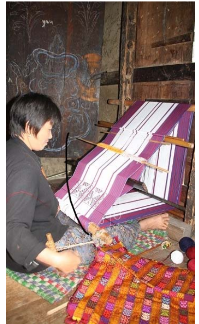
Above: weaving centre in Khoma Below left to right: paper recycling, pickle production and LEP trainees 2011 in Thimphu.

Today, as free market corporate and private industries replaces Bhutan's traditional subsistence economy and as materialism and consumerism spreads across the country, Loden aspires to cultivate a wholesome entrepreneurial and business culture which is ecologically, culturally and socially responsible. To this end, we also continually endeavour to create a web of highly skilled international and local experts as voluntary trainers and mentors. A new Loden expert on entrepreneurship in Bhutan will also be appointed in 2012. The Loden entrepreneurs have also united to form an association in order to work together, learn from each other, barter their products and services and abide by a common standard and values.