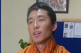
Kuenga Dhendup Carpentry and wood works