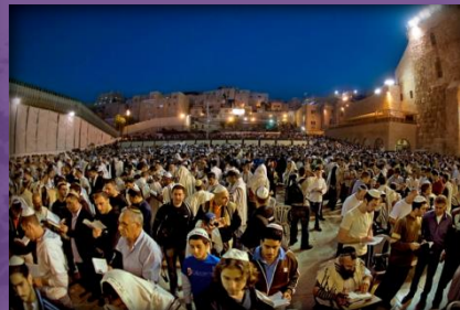
Levant Planning USEUCOM / USCENTCOM