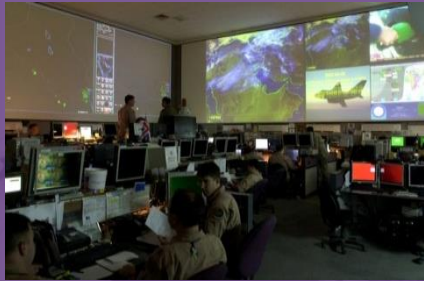
Operation Gladiator Shield Global Cyber