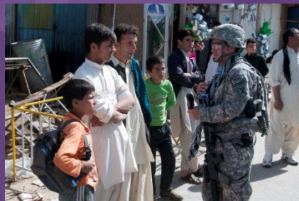
Office of Security Cooperation Iraq