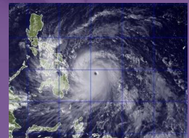
Humanitarian Assistance USPACOM

Requires a synchronized unified effort across a global infrastructure