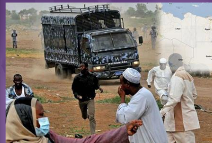
Operation Jukebox Lotus Juniper Micron USAFRICOM / USEUCOM