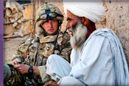
Operation Enduring Freedom ISAF-Afghanistan