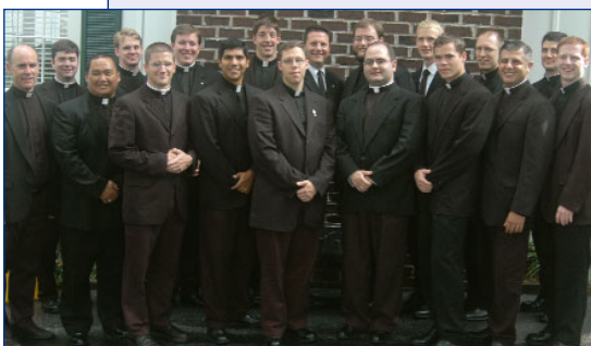
Seminary Orientation Team

Reflecting national trends, the seminary student body reflects a growing ethnic diversity. Thirty seminarians were born outside the United States—representing 15 different countries of origin. Eleven percent of the student body is Hispanic; seven percent Asian/Pacific Islander; two percent African, and two percent Polish.