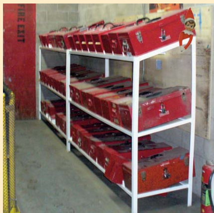
Cleaning stations and tool box racking, two simple yet effective improvement efforts in Building 10.