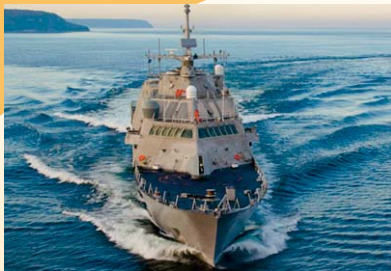
USS Fort Worth (LCS-3) enters the US 7th Fleet area of operations – Singapore region. See page 4 for more details.