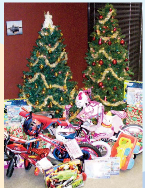
Toys donated by MMC employees that will bring smiles to the faces of area children on Christmas morning.

Because of your help through both programs the children will receive, on average 8 items each, which includes clothing, large and small toys, stuffed animals, board games, dolls, puzzles, sports equipment, baby items, coloring-books with crayons, and stocking stuffers. Thank you for supporting your local community and making these two programs a success.