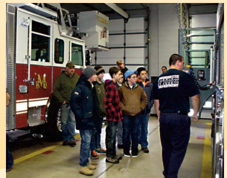
Representatives from the Marinette Fire Department sharing details with the young boys about the fire trucks.