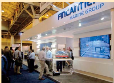
MMC, along with FMG, exhibited at the 35th annual WorkBoat Show – the Largest Commercial Marine Trade Show in North America. See page 8 for more details.