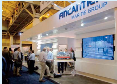
The FMG booth featured ship models as well as large format video and photography.

Captain Richard Phillips, whose ship the Maersk Alabama was hijacked in 2009 by Somali pirates, gave the keynote speech to a rousing ovation. This was the first hijacking of a US ship in more than 200 years. The story was made into the movie, “Captain Phillips,” starring Tom Hanks.