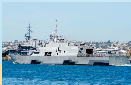
USS Fort Worth arrives at Singapore's Changi Naval Base early in December.