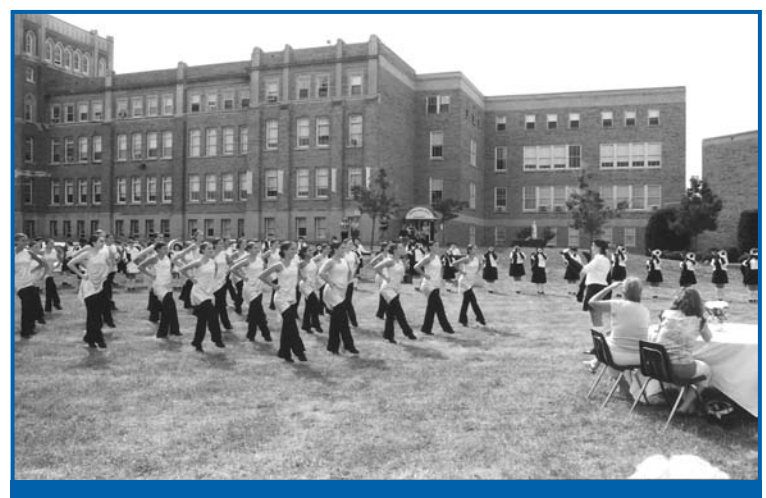
The MSM Marching Band makes a breath-taking performance.