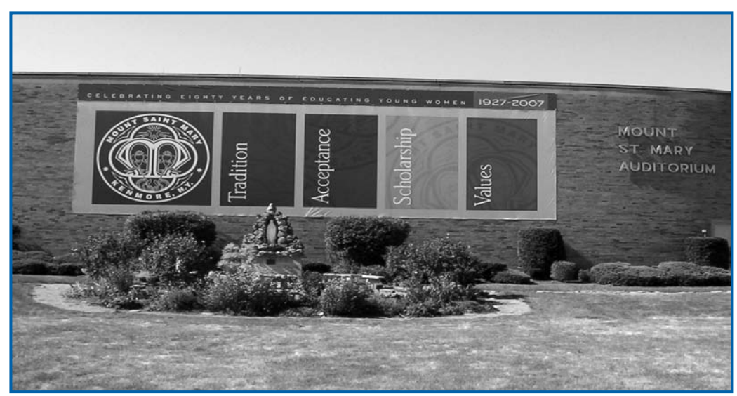
We invite you to stop in for a tour and view these impressive displays.

If you're in the area, you cannot help but notice the colorful banner hanging from our auditorium behind the grotto. Powerful words that summarize our philosophy -- tradition, acceptance, scholarship and values -- let our community know in an instant who we are and why we're successful.