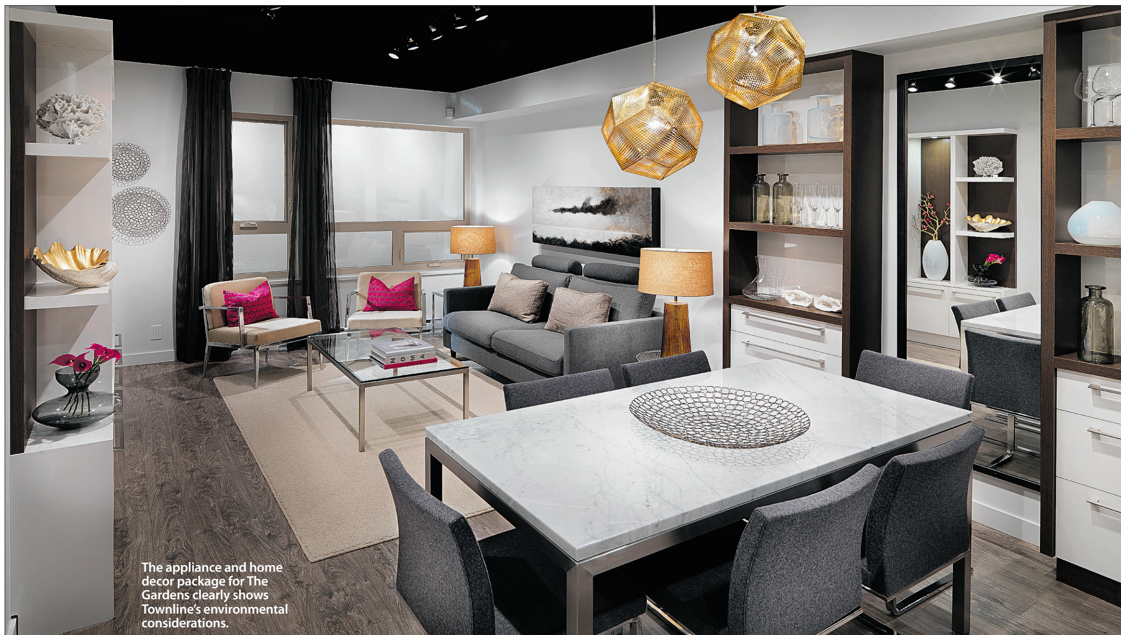
The appliance and home decor package for The Gardens clearly shows Townline's environmental considerations.