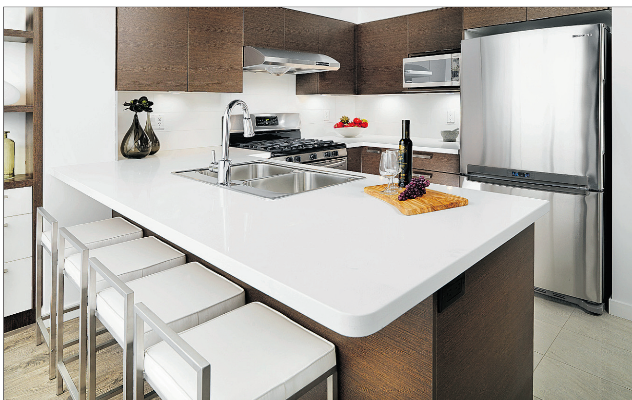
Kitchens feature GreenGuard Certified Greenlam cabinets and doors, with high efficiency Energy Star stainless steel appliances.

There will be a total of five gardens on-site. Influenced by Richmond's rich farming heritage, the Play Gardens will be an open, green space specifically built for children to discover, play games, and run free. The agricultural theme is expanded on the Farm Gardens, an acreage that has been set aside for local area residents who want to try their hand at cultivating their own fresh, organic food. The Secret Garden is perfect for the simple beauty of doing nothing at all, just thinking, meditating, reading or admiring the lush scenery, while the