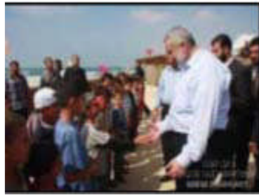
Ismail Haniya

The ITIC also provides photos of UG-funded summer camps including Hamas Prime Minister Ismail Haniya visiting one such a camp in Gaza, and a camp group named after shaheed (martyr) Ismail Abu Shanab, one of the Hamas leaders in the Gaza Strip, who was killed by Israel in August 2003. 150