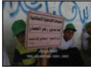
Summer camp

Appearing to confirm the UG's support of Hamas, Khaled Mishal, head of Hamas' political bureau in Damascus, was reported in 2007 to have thanked UG leader Youssef Qaradawi, whom he said: