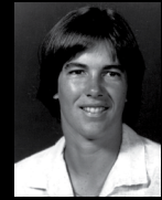
TARA VANDERVEER 1980-85 (110-37, .748)