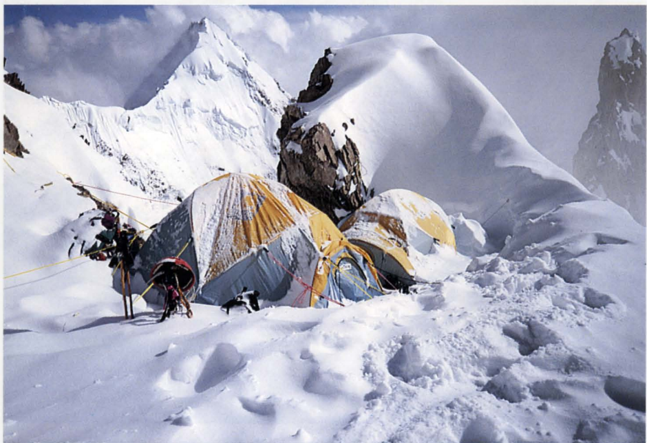
19. Camp 2, at 6600m, after a heavy snowfall. ( Jonathan Wakefield ) (p39)