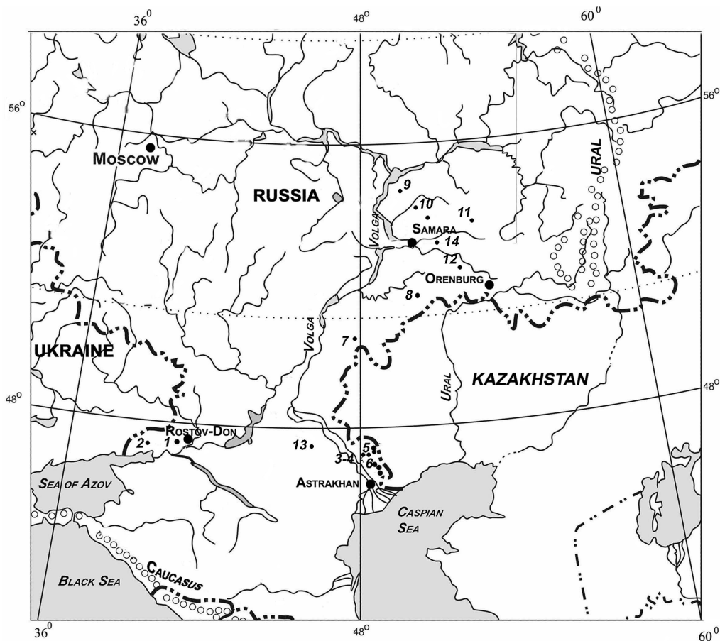
Figure 2 Map of the Neolithic sites in southern Russia and the Lower Volga River basin regions investigated: 1-Rakushechny Yar; 2-Matveyev kurgan; 3-Kairshak I-III; 4-Kugat IV; 5-Tektensor I, III; 6-Burovaya; 7-Varfolomeyevka; 8-Lebyazhinka; 9-Yelshanka; 10-Chekalino IV; 11-Maksimovka; 12-Ivanovskoe; 13-Dzangar; 14-Il'inka.

The Yelshanian-type pottery as the earliest technology of this kind on East European Plain has been first recognized by I B Vasil'ev in the Samara-Volga area in the 1970s (Yudin 2005). By now, the typical "Yelshanian assemblage" has been identified at several sites: Staraya Yelshanka I, II, Maksimovo, Chekalino, Lower Orlyanka, Ivanovka, Lugovoye III, Lebyazh'ye I, Bol'she-Rakopvskaya, Il'yinskaya, Krasnyi Gorodok, Zakhar-Kolma, Vilovatovskaya, and a few more (Mamonov 1995). Amongst all these sites, the "pure Yelshanian element" has been recognized only in 2 cases, the lower strata of Chekalino IV and Lower Orlyanka II. (Figure 2, #9–14).