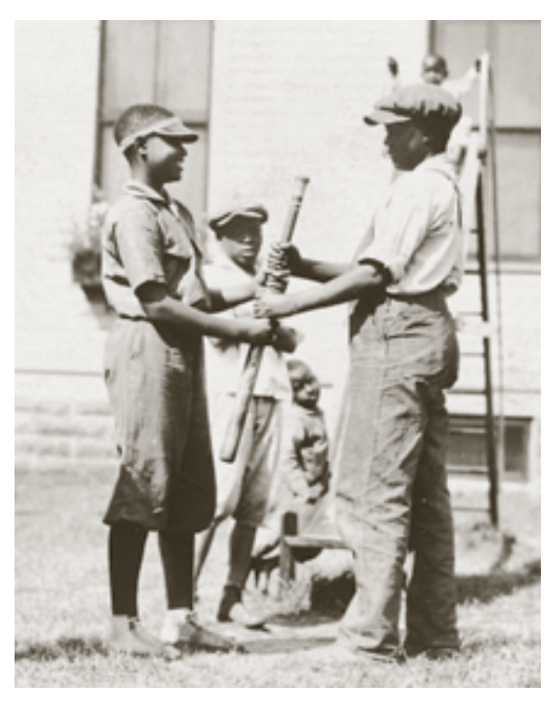
Baseball players, Phyllis Wheatley House, about 1925

31.\,St.\,Paul\,Pioneer\,Press,\,Sept.\,\,23,\,1908,