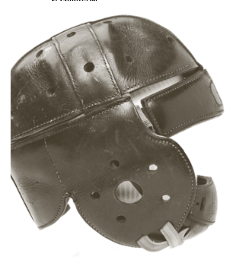
Leather football helmet, 1916

The day was cold in Chicago, and the game, played in a drizzling rain, became a defensive showdown on a muddy gridiron. Chicago depended on the speed and ability of quarterback Walter Eckersall against the so-called "Giants of the North." Newspapers circulated stories of what the talented Eckersall was "going to do to Minnesota."14