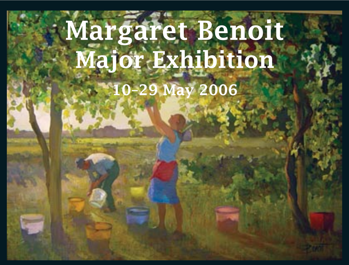
Sunlit Trellis oil 46 × 61 cm