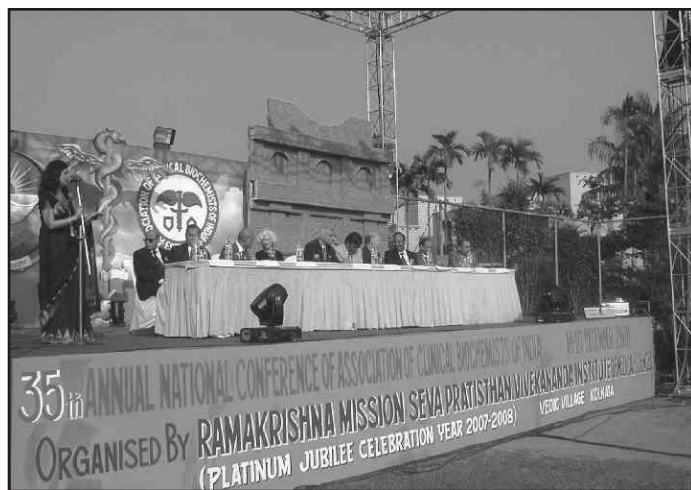
Inaugural Function : 35th ACBICON

The XXXVth Annual National Conference of Association of Clinical Biochemists of India (ACBICON 2008) was held from December 19-21, 2008, in ACBI (Vedic) Village, Kolkata, India. The Venue of the conference was the 'International Natural Resort', a 5 star eco-friendly state-of-art convention centre at the background of beautiful nature. This conference commemorated the Platinum Jubilee Celebration of the hosting institute, Ramakrishna Mission Seva Pratishthan, Vivekananda Institute of Medical Sciences, Kolkata.