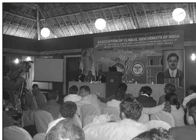
G.B. Meeting : 35th ACBICON, Kolkata