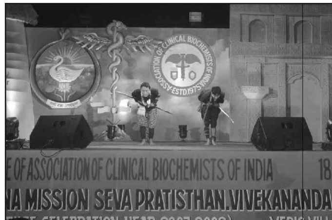
Martial Art Dance (Manipur) : 35th ACBICON, Kolkata

The Industrial exhibition reached a scale unmatched by any previous academic conference. The participants included 25