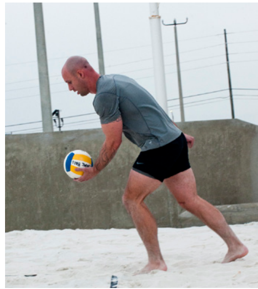
A Sparta-Licious member prepares to serve the ball during the first match of the game against EAD on July 16, at Cooper Field. Sparta-Licious only needed two games, 21-13; 21-15 to win the match.

"We usually meet up at Windmill Beach every