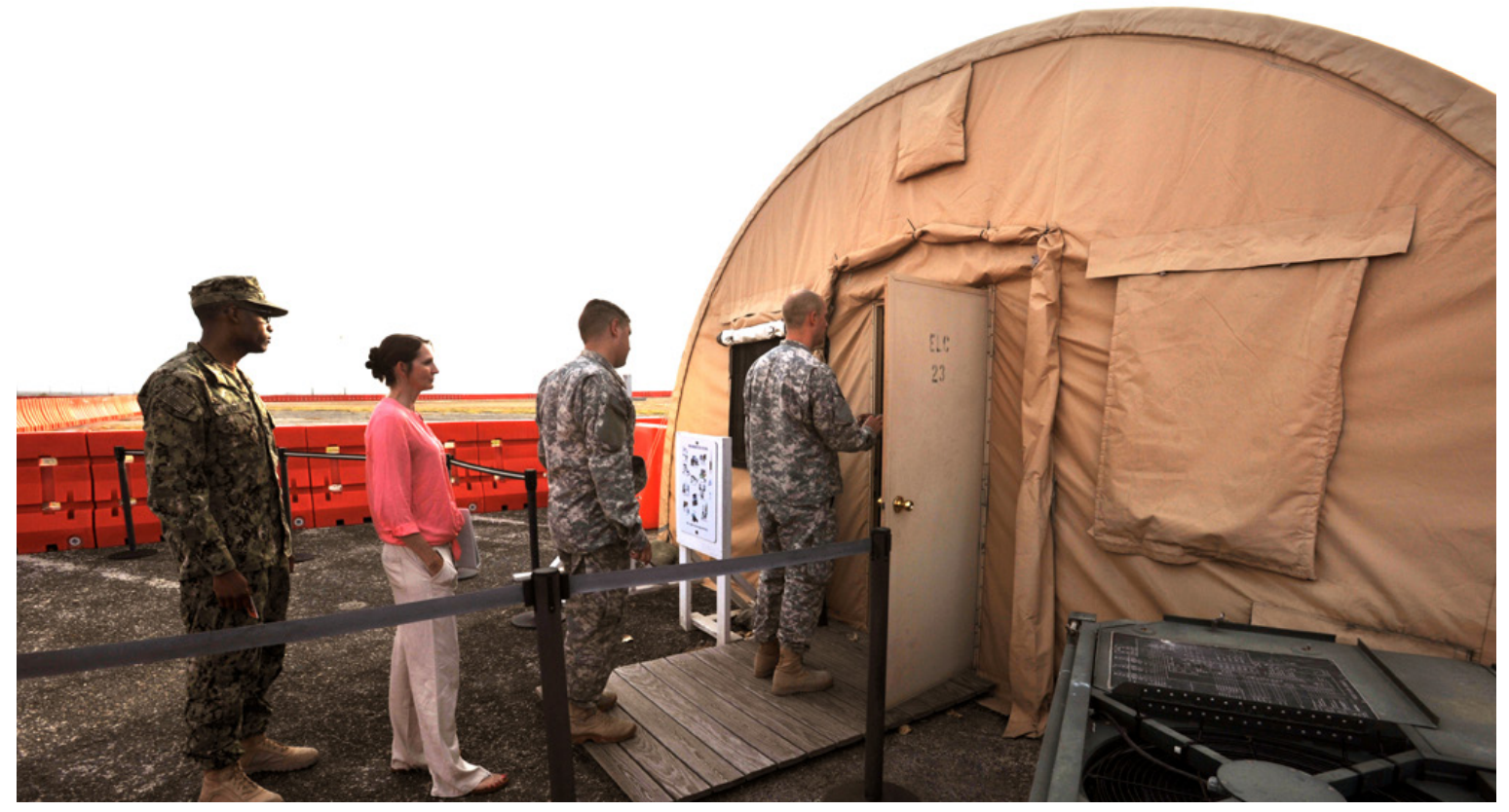
Role players enter a controlled area in preparation for the upcoming military commissions July 21, at Guantanamo Bay. Military police, assigned to Joint Task Force Guantanamo, underwent specialized training to enhance proficiency for entry control point operations. Others came aboard for a full dress rehearsal to give an aspect of realism to the training, acting as lawyers, reporters and occasionally an infiltrator.

In preparation for the ongoing military commissions, military police assigned to Joint Task Force Guantanamo underwent specialized training to enhance proficiency for entry control point operations.