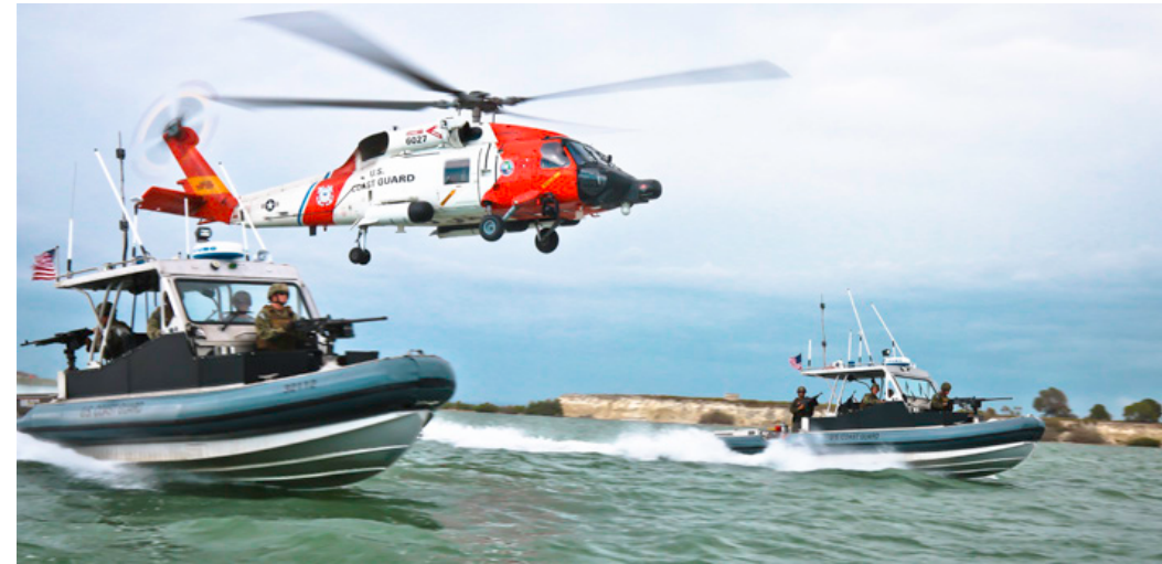
Top: An HH-65 Dolphin helicopter flies alongside a first generation transportable port security boat during one of the first Coast Guard deployments in 2002, when Joint Task Force Guantanamo was first established. Bottom: A U.S. Coast Guard MH-60 Jayhawk helicopter races along side two 32 foot transportable port security boats, during a scheduled patrol stop, held by the 308th MARSECDET at Guantanamo Bay, July 8.

A 2002 photo showing an HH-65 Dolphin helicopter racing alongside a first generation transportable port security boat off the shores of Guantanamo Bay, has become iconic for its historic significance to the Coast Guard. It was the same year the Bush Administration formed Joint Task Force Guantanamo's Maritime Security Detachment.