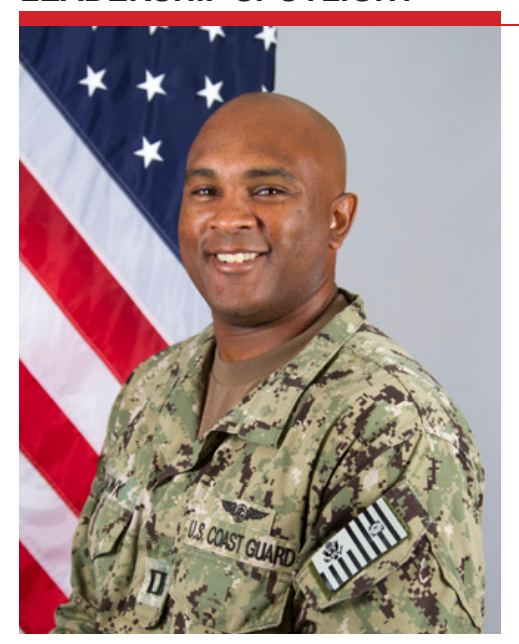
Operations Officer, JTF GTMO MARSECDET

When you look around this base, it is not difficult to find a source of pride. First and foremost you can find it in yourself. We are all members of a very exclusive club. Less than 0.5 percent of Americans serve in the armed forces. To put that into perspective, less than 30 percent of America's population is qualified to join the military due to legal issues, not meeting weight