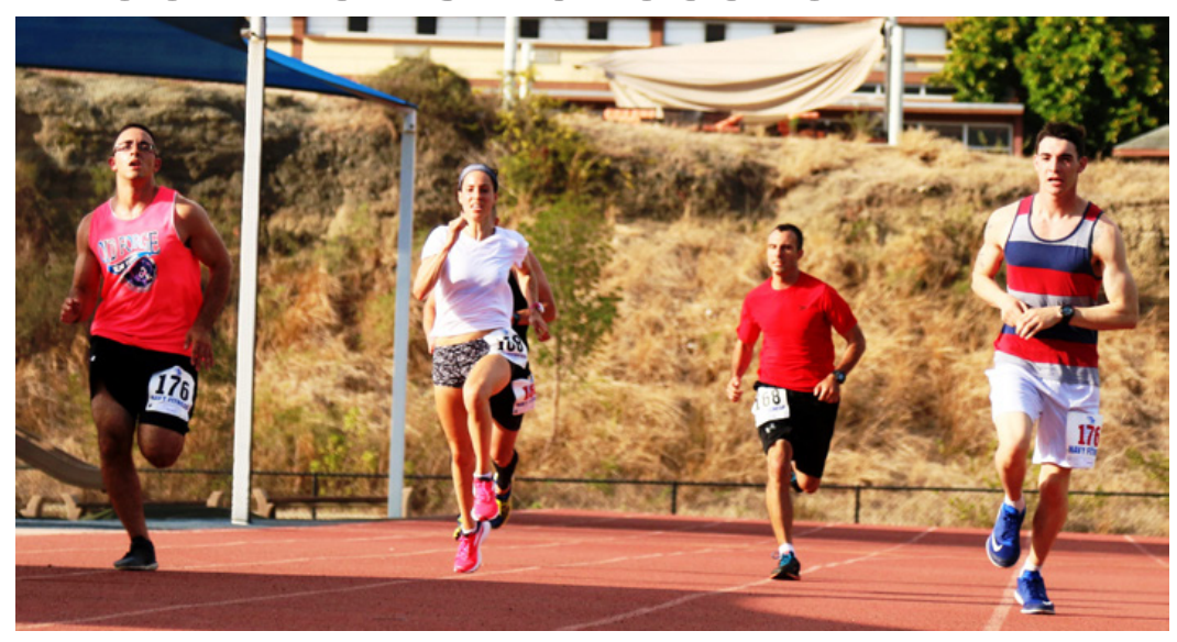
Joint Task Force Guantanamo relay race participants fight for first place here July 18, during the final stretch of the last leg. Runners dash to the finish line during the relay race held by the Morale, Welfare & Recreation program.

Sweat pours from their faces as their feet strike the ground one after the other. Hearts beat fast as the air becomes harder and harder to breathe. Their muscles tire as their bodies are pushed to their absolute limits. Smiles shine through as they finally cross the finish line and tag their partners Saturday, July 18, here.