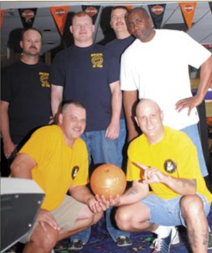
◀ Sailors from the First Class Association and the Chief Petty Officers Association went pin for pin at the Marblehead Lanes Bowling Center to participate in a friendly competition, Friday, Oct. 12.