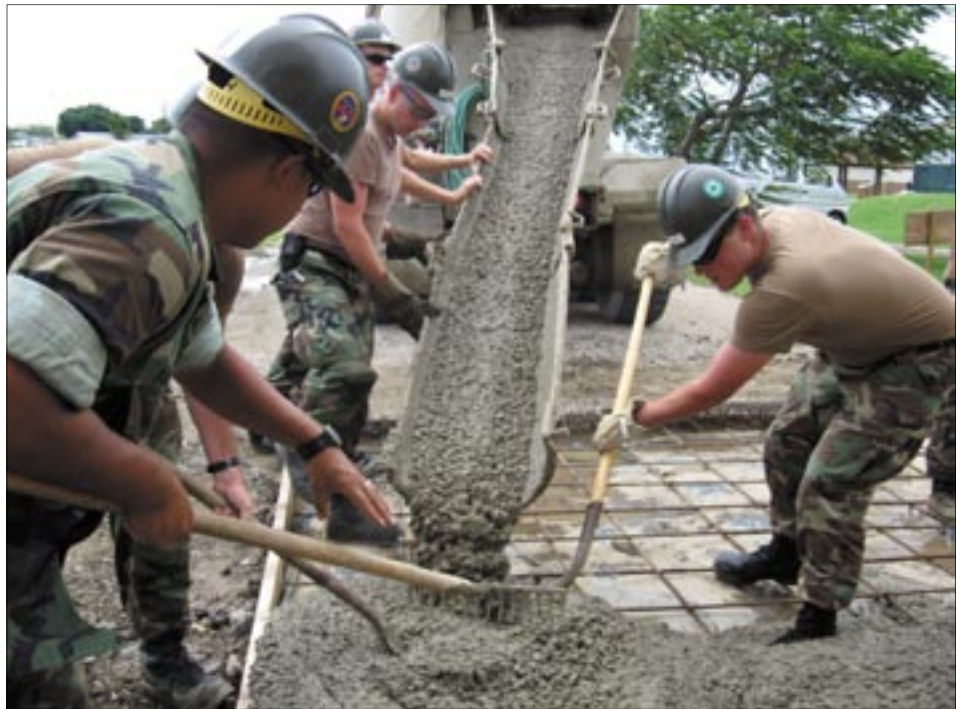
Seabees of the Fighting Forty repair a damaged section at the Leeward Airport on Thursday, Oct. 11.

The Fighting Forty fought and built in the South Pacific in World War II. They shed blood and sweat with Marines in the jungles of Vietnam. They built temporary cities in the desert during Operation Desert Storm and they built shelters and raised the spirits of the needy in Somalia during Operation Restore Hope. They worked along side the Army in the hostile zones of Bosnia-Herzegovina in support of Operation Joint Endeavor and served bravely in support of the Global War on Terror. The brave members of the Fighting Forty built and fought with all of