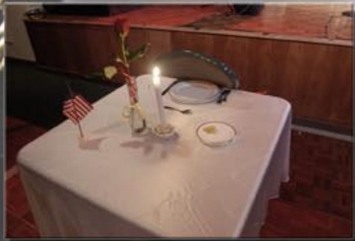
Servicemembers from Naval Station Guantanamo and Joint Task Force Guantanamo come together to celebrate the Navy's 232nd Birthday at the Navy Ball Oct. 13.