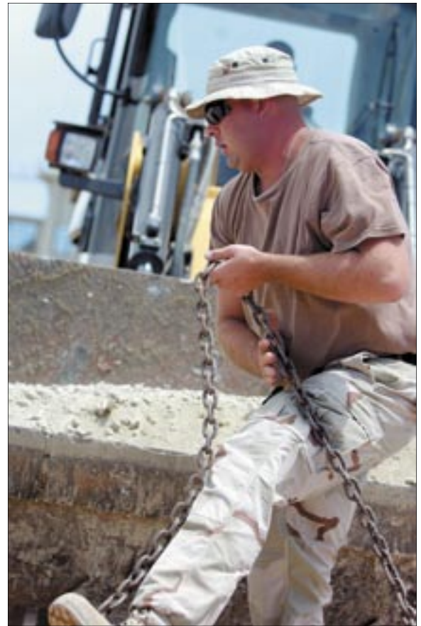
"Dirt boys" from the 474th Expeditionary Civil Engineering Squadron prepare to lay a permanent foundation for Guantanamo Bay, Cuba's new military commissions courtroom expected to be completed early next year. Using plattes developed by the 883rd Red Horse team, the 474th broke ground on the project Sept. 11.

"I feel I am doing something that is extremely important and vital," he said. "I am trying to put the best foot forward on behalf of JTF to provide the support that is necessary for this mission to be completed."