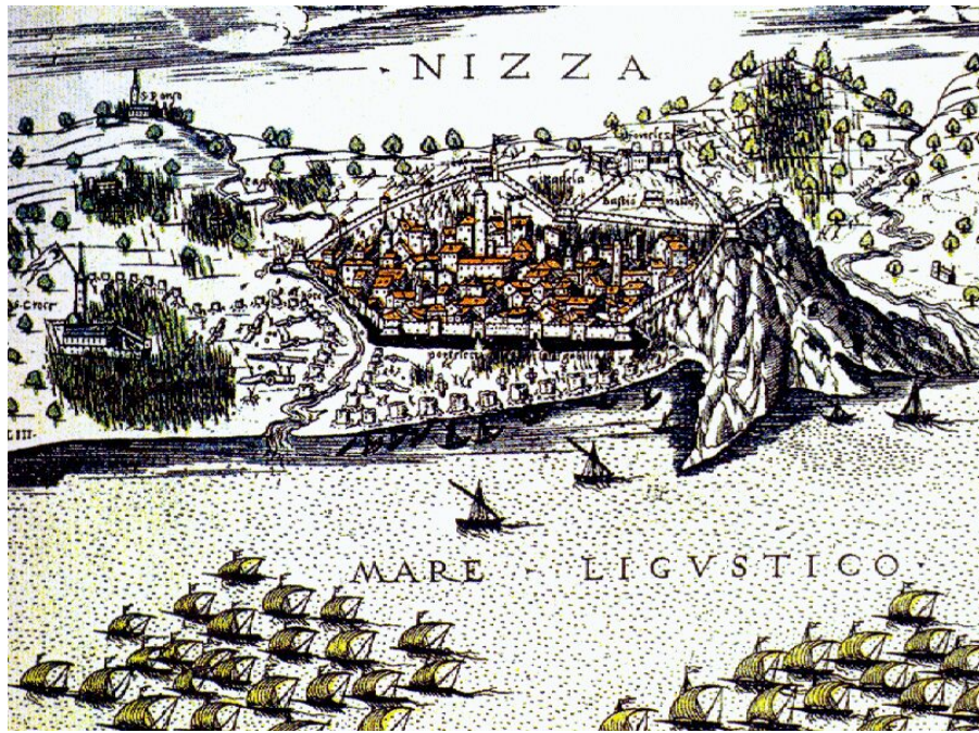
Figure 1. Nice besieged in 1543, drawing by Eneas Veco. At left, the convent of the Holy Cross.

But the destruction of the convent of the Holy Cross was soon to follow its pivotal role in the congress. Nice was such a tempting prize for François I that, four years later, he ordered Jean-Baptiste Grimaldi, Lord of Ascros, to resume hostilities. In 1542, therefore, the ephemeral truce was broken. The following year, after several successive violations of the treaty of 1538, the French, under the command of the duke of Enghien, besieged Nice, while the Turkish fleet, allied to France, blockaded the harbor. The citadel resisted, but the city of Nice was looted and burnt, its environs devastated. The convent of The Holy Cross, without protection, capitulated in 1543, under assault from the Turkish corsair Khayr-Al-Din, "Red Beard". For some time thereafter, the convent sheltered the attackers, and the Turkish Crescent floated from its summit. The sack that followed was complete, the convent was entirely destroyed by fire.