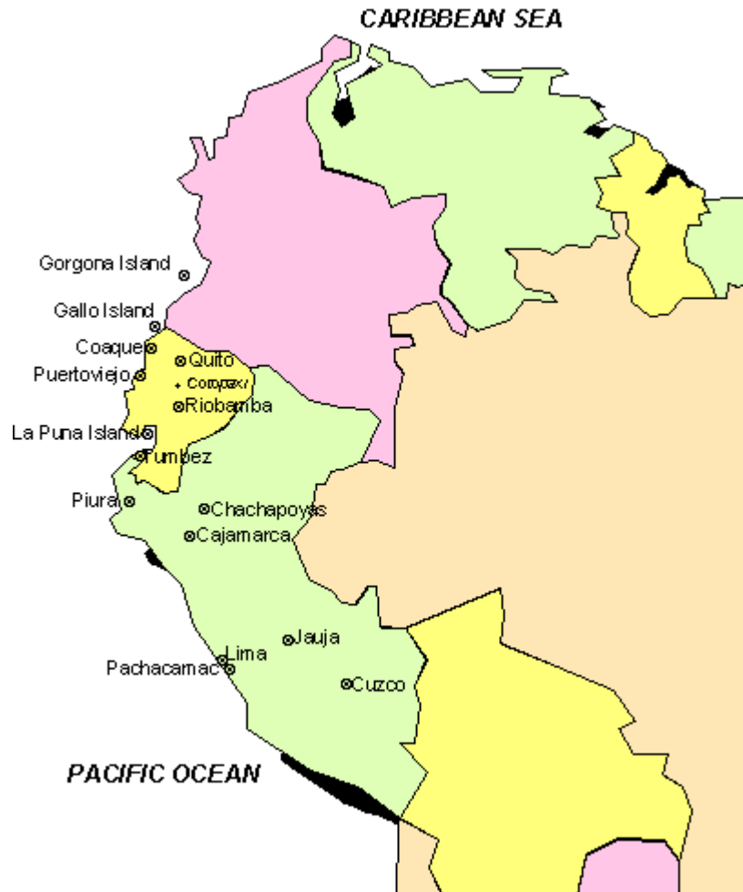
Figure 4. Ecuador and Peru map.

It was probably during this period, from August to December 1534, between the end of hostilities and his final departure from Peru, that Fray Marcos collected the material he used to write the "History of the conquest of the Quito" reported by Velasco. For the section on Belalcázar's campaign, he must have taken testimony from participants. During Alvarado's campaign and the conclusion of the conquest, on the other hand, he would have been an eyewitness himself.