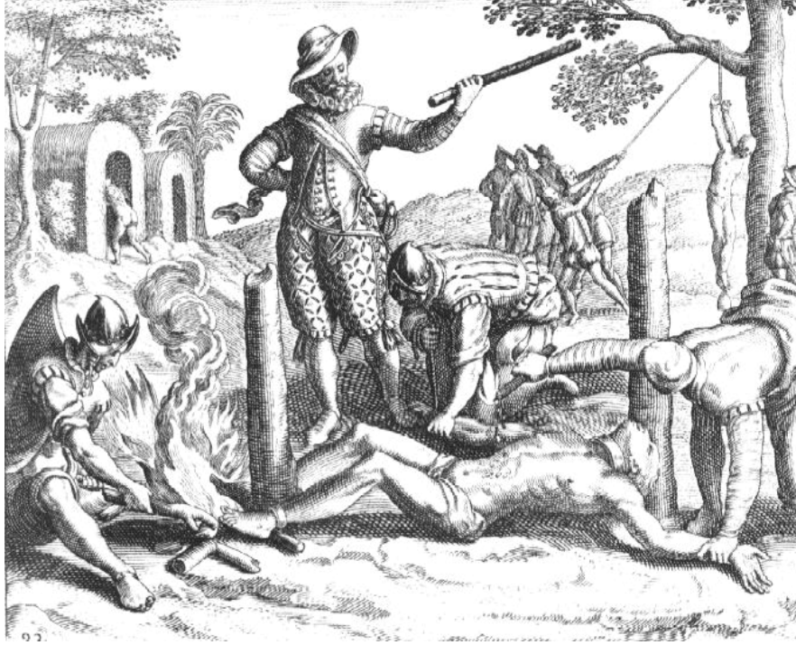
Figure 5. Spaniards' cruelties. Engraving by Theodore de Bry, illustrating Las Casas' Destruction.

Once discovered America and the millions of its inhabitants, Franciscans, then the largest monastic order of the Christendom, are among the first to react and to send missionaries. And from the arrival of the "Twelve Firsts" in New Spain in 1524, all the Franciscans who will cross the Atlantic Ocean will be, for long, Minors of Observance. Millenarians, they want to build in America Saint Augustin's Civitas Dei that should precede, according to the Father of Church, Saint John's Armageddon. Visionaries, they are ready for anything to reach their goal. They consider the Indians as Gentiles, having been concealed for centuries by God to the knowledge of mankind: Indians have the same nature than Europeans; simply they never knew God's Word, and they are always in a "natural" condition.