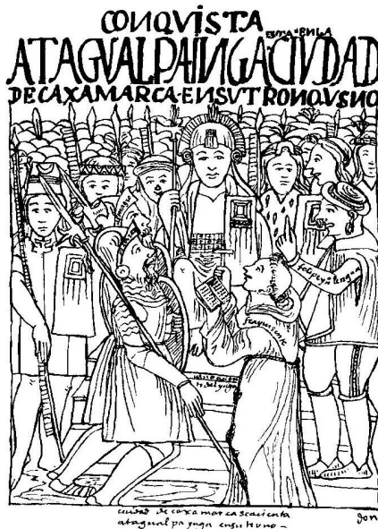
Atahualpa's capture by Pizarro. Drawing by Guamán Poma de Ayala.