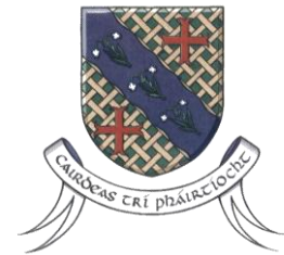
Mountmellick Town Council