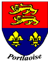
Portlaoise Town Council