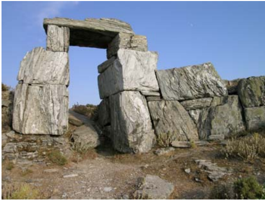
Figure 2: The postern seen from the north