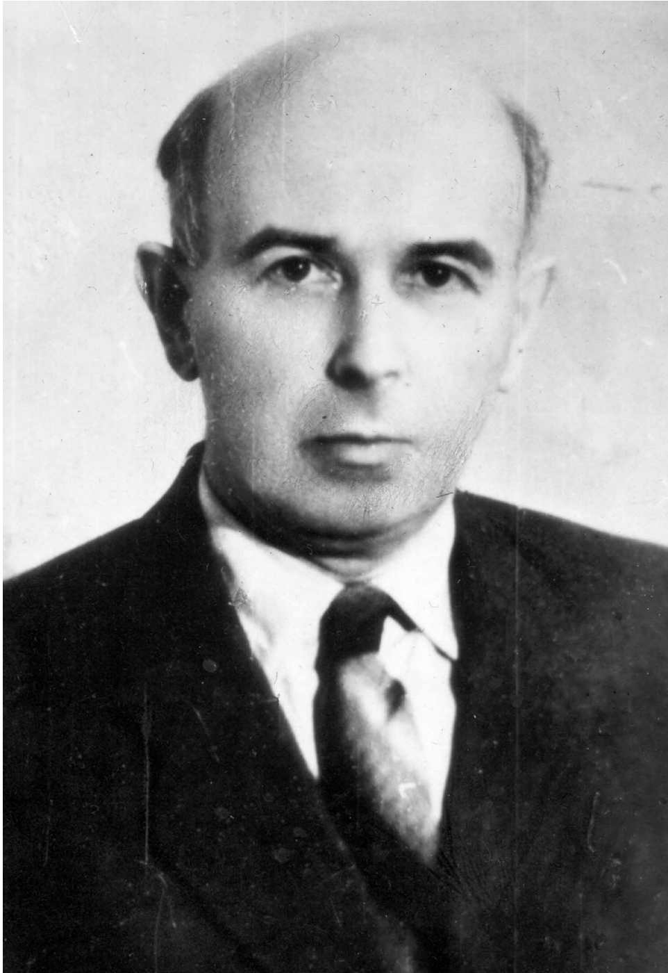
FIGURE 1. Evgeniy Nikolaevich Savchenko (1909–1994), Kiev (the picture date is not established).

The Institute for Sugar Beets of the Ukrainian Academy of Agrarian Sciences was founded in 1922. It was one of the first large agricultural scientific institutions after the revolution (1917), founded for studying scientific and practical problems of breeding.