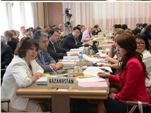
20 th and final meeting of the Working Party on the Accession of Kazakhstan – 22 June 2015