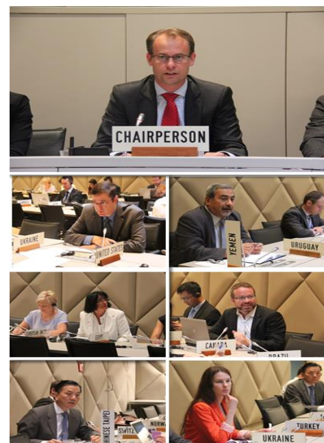
6 th IGA meeting, 25 June 2015