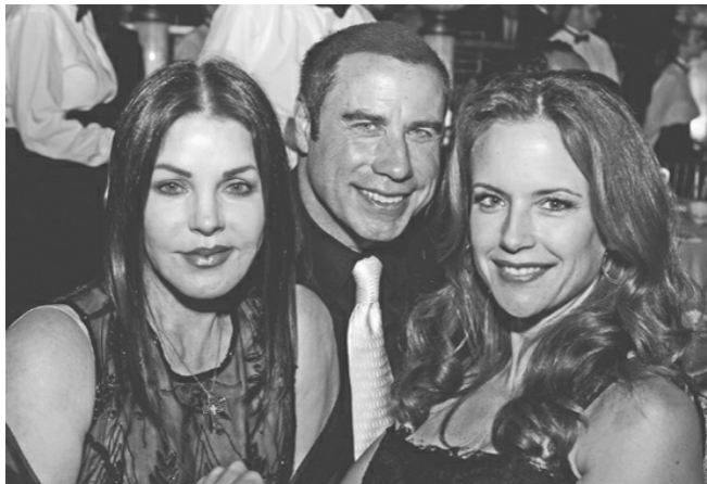
Priscilla Presley, John Travolta, and Kelly Preston at the Church of Scientology Celebrity Centre's thirty-seventh-anniversary gala, Hollywood, August 2006