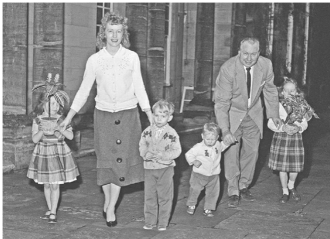
Mary Sue and Ron with Diana, Quentin, Arthur, and Suzette

enforcer. One of Hubbard's executives later described her as "pragmatic, cold, cunning, calculating, efficient, and fiercely loyal." She had flinty blue eyes, a sharp, prominent nose, and a rare lopsided smile that would expose her uneven, slightly crossed front teeth.