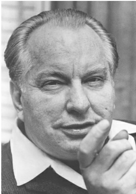
L. Ron Hubbard in the 1960s

There seemed to be two Hubbards within the church: the godlike authority whose every word was regarded as scripture, and