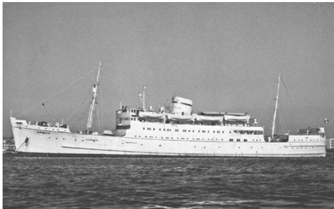
Portuguese postcard of the Apollo

communications to the bridge; at times the nose of the ship was pointed directly down into the sea. The storm lasted ten days, propelling the ship eight hundred miles north, all the way to the Azores.