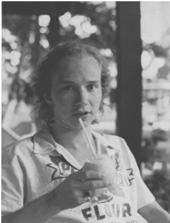
Paul Haggis on vacation in Antigua in 1975, the year he joined the Church of Scientology