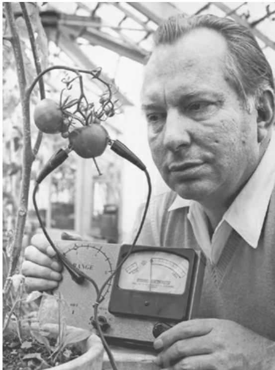
Hubbard using the E-Meter on a tomato in 1968 to test whether it experiences pain