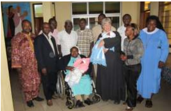
The Good Shepherd Home local board with new babies (There is also an American board that governs finances)