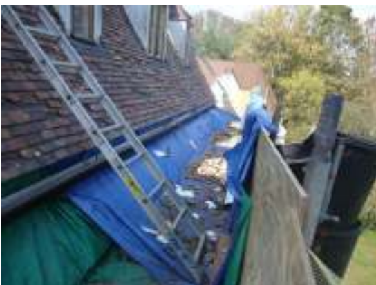
Removal of damaged tiles makes room for new ones. Some old tiles will be reused.