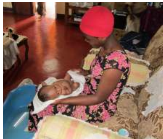
An abandoned baby newly arrived at the Home