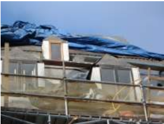
Upper and lower dormer repair

Last week the tunnel infill was completed. The pumping in of the Geofill was done over 2 days. One of the skylights was removed and used as the entrance point for the pumping. The skylight will be restored and replaced as requested by the New Jersey Historic Trust.