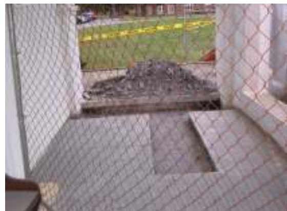
Groundwork is being laid for a sloping walkway over the south cloister.