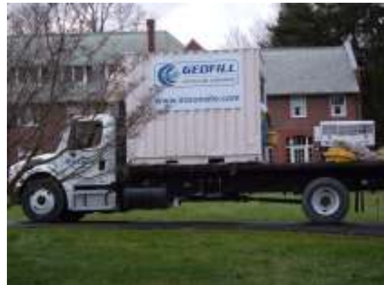
Arrival of material to fill the tunnel, which has been unsafe. A new barrier-free passage is planned.