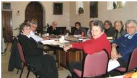
“Illumine My Heart” class on the Mystics