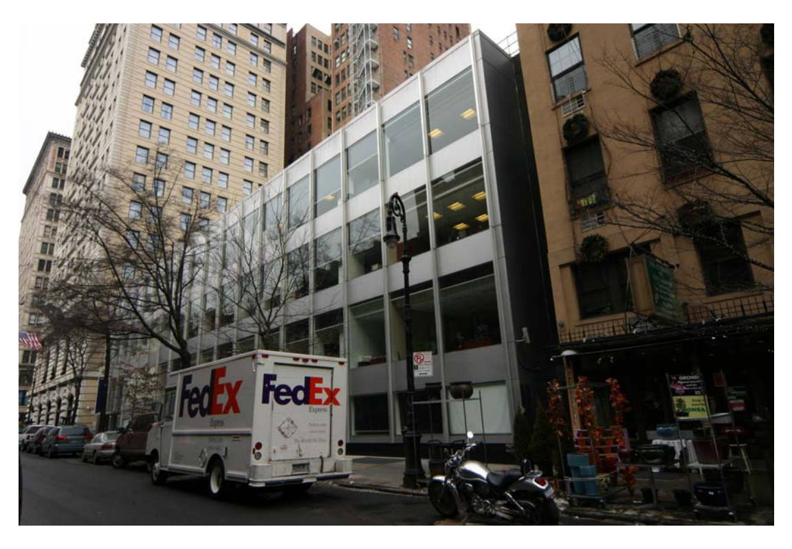
17<sup>th</sup> Street facade, looking west