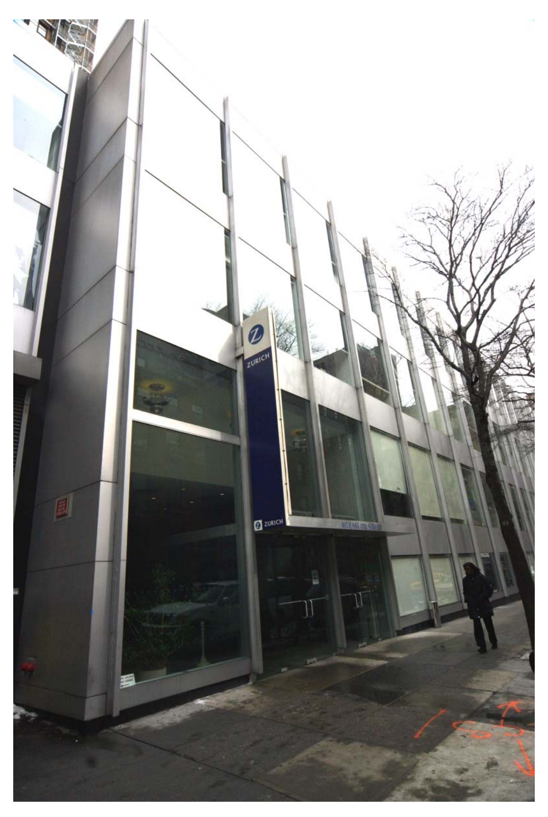
17<sup>th</sup> Street entrance, looking east