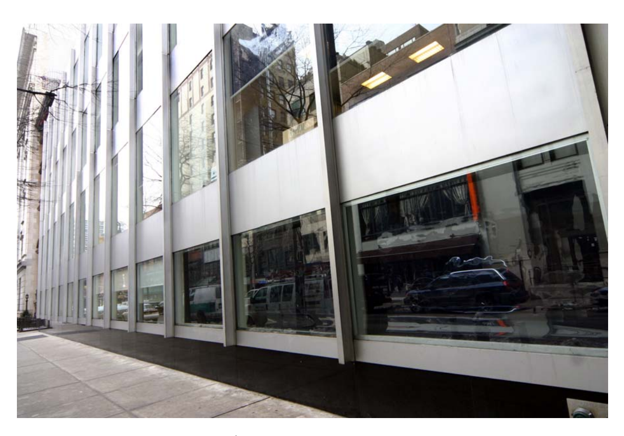
East 18<sup>th</sup> Street facade, base, looking east