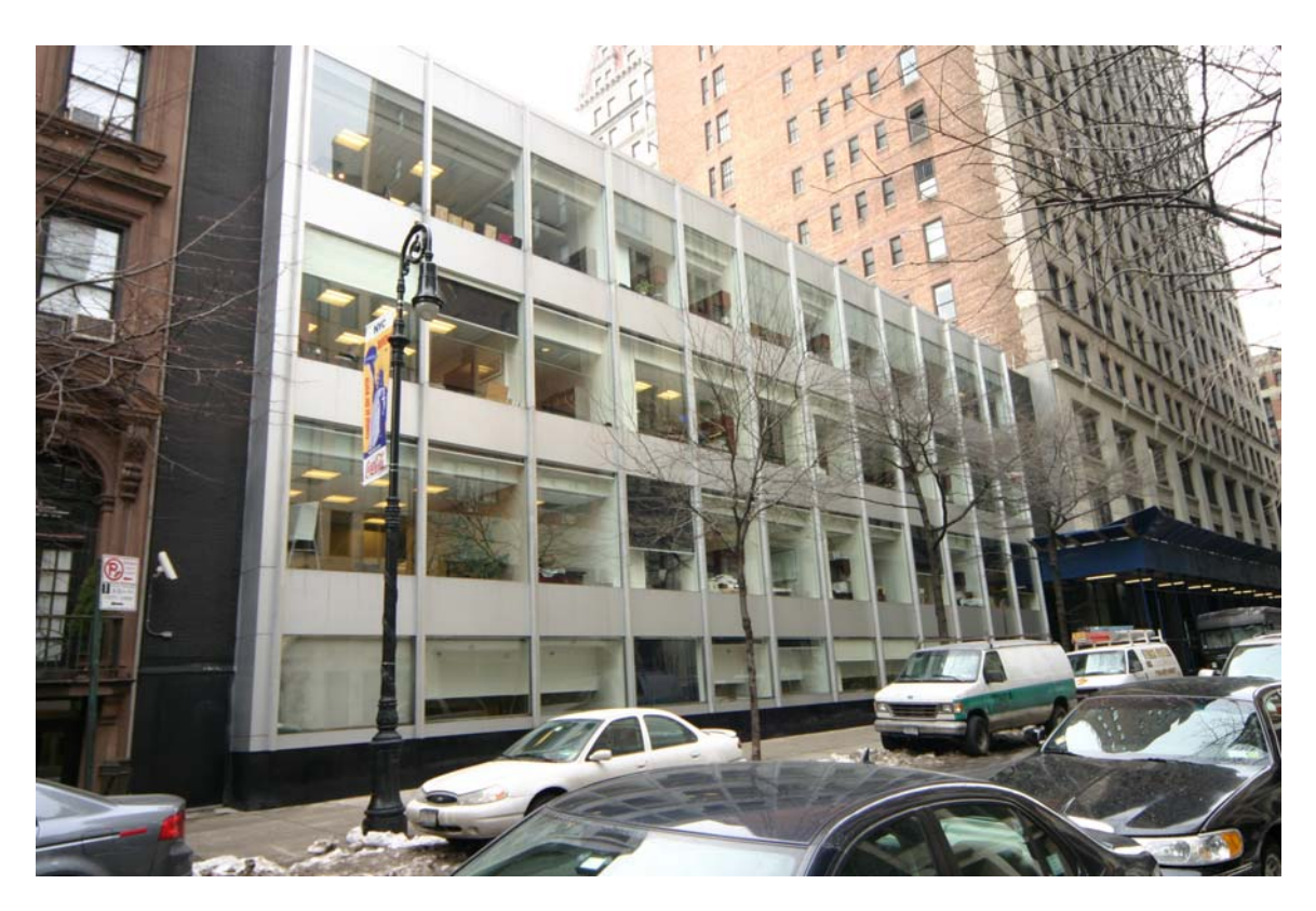
East 18<sup>th</sup> Street facade, looking west