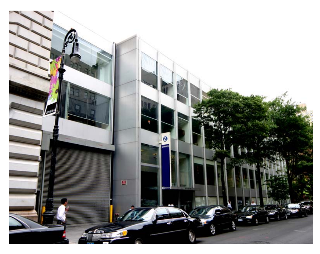
Guardian Life Insurance Company of America Annex 105-117 East 17<sup>th</sup> Street, 108-116 East 18<sup>th</sup> Street. Manhattan 17<sup>th</sup> Street facade, looking east