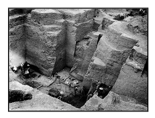
Excavation of a Shang royal tomb