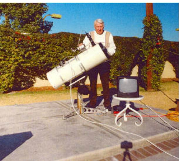
Photo of the moon taken May 5th, 1998 by Alan G .Toleman from his backyard near Camelback & 36th St. Alan's set up is shown above. It is a modified Meade 10" f/4.5 with the Primary Mirror refigured by Galaxy Optics to 1/16 wave. He used an Olympus OM-1n Camera with mechanical mirror lock-up an Olympus Vari-magni finder set at 2.5x. This was Alan's first attempt at astrophotography. Not a bad shot from the heart of Aurora Phoniecia.