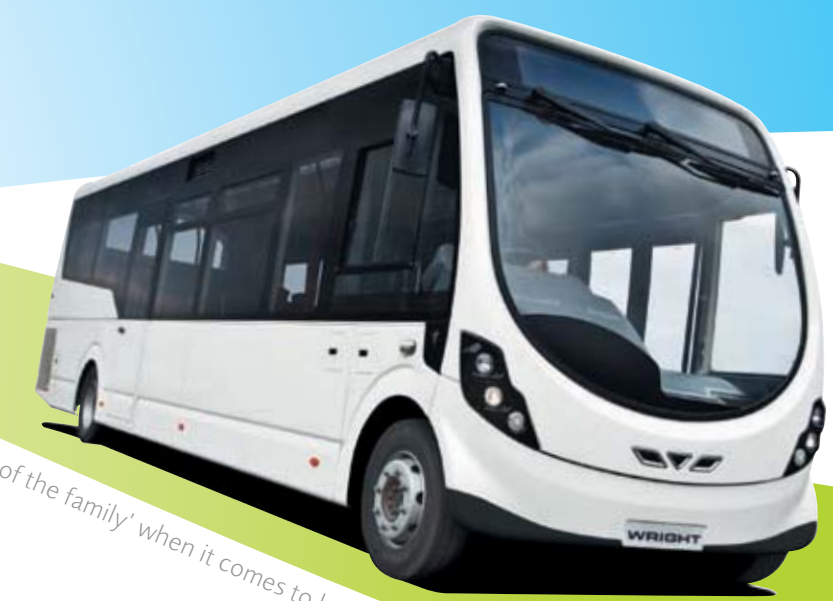
StreetLite - definitely 'one of the family' when it comes to looks and style.

Equally at home navigating busy city streets or quiet country backroads, StreetLite sets new standards in the midi bus market. It's the first vehicle of its kind to be certified to European Community Whole Vehicle Type Approval.