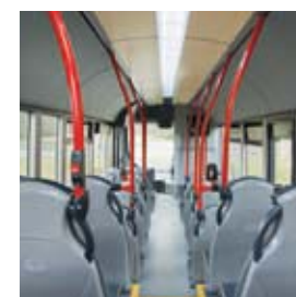
Most seats in class