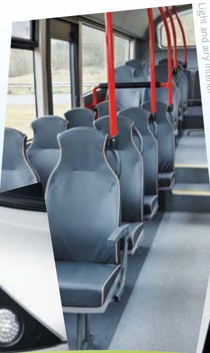
Light and airy interior