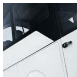
Clean lines and a reduction in the number of components