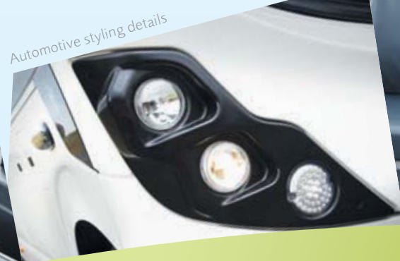
Automotive styling details