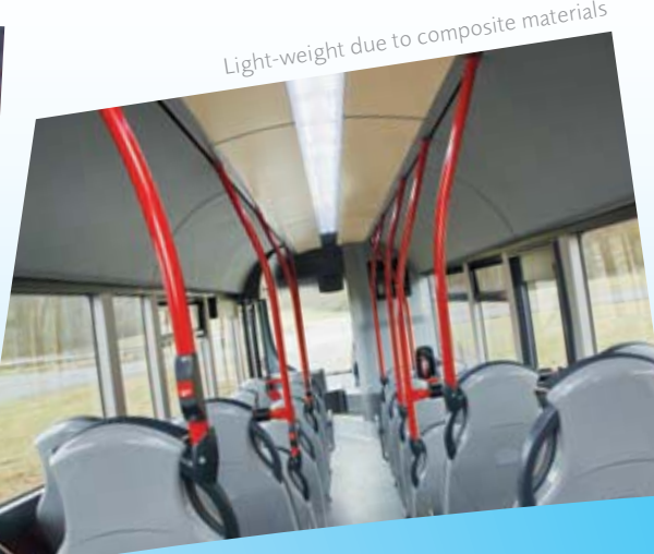
Light-weight due to composite materials