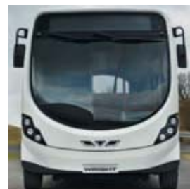
Definitely a Wrightbus

This, coupled with the use of composite materials, has contributed to a midi bus which delivers a new level of quality and innovation in a vehicle of this size and type.