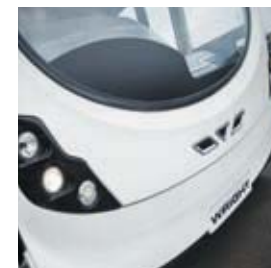
One piece front bumper