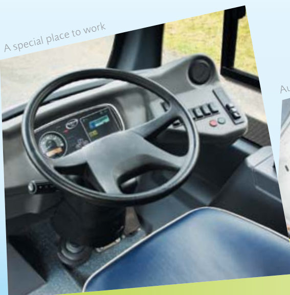
A special place to work