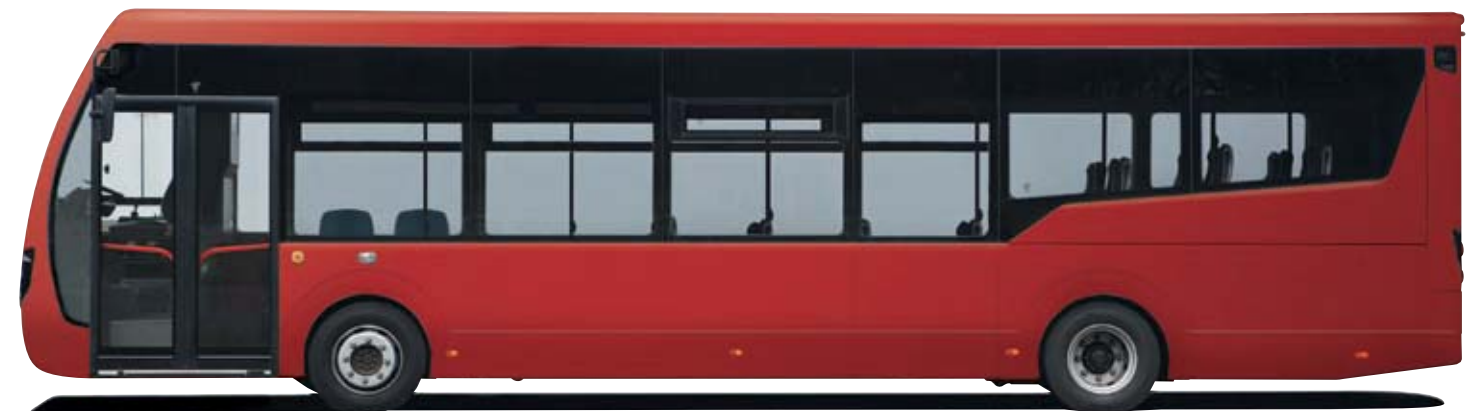
StreetLite can also be specified for left hand drive markets and as a 2 door variant for TFL operation.