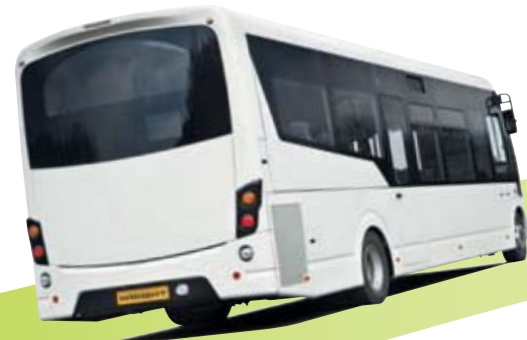
High proportion of low-floor seating