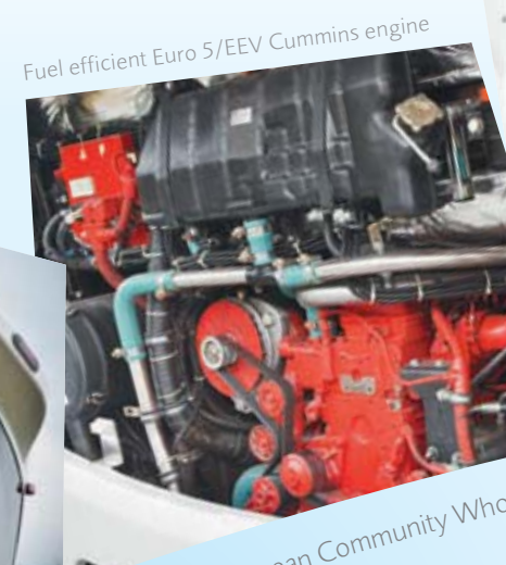
Fuel efficient Euro 5/EEV Cummins engine