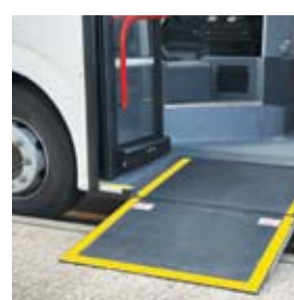
Available in mid and forward door configurations