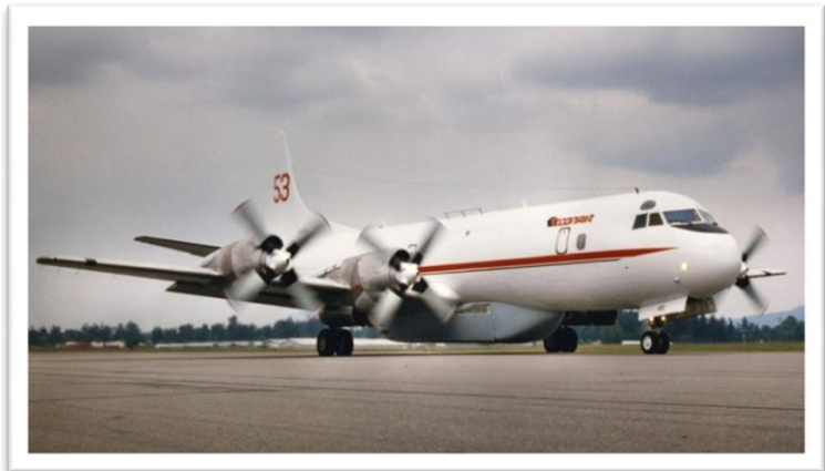
Figure 61: Conair L188 C-FZCS Tanker 53 Abbotsford 1999

Conair, in joint venture partnership with the B.C.F.S., also developed an L188 Electra with a 12 door compartmented tank. Tanker 53 was online that summer based out of Abbotsford. Also that year Conair, partnered with Kelowna Flightcraft Ltd., proposed the development of the twin engine Convair 580 air tanker. A flight evaluation with a non-tanked 580 was undertaken by the Forest Service, Conair and Kelowna Flightcraft in September. Results were very encouraging and the program continued through the fall and winter with the development of the new RADS II constant flow tank.