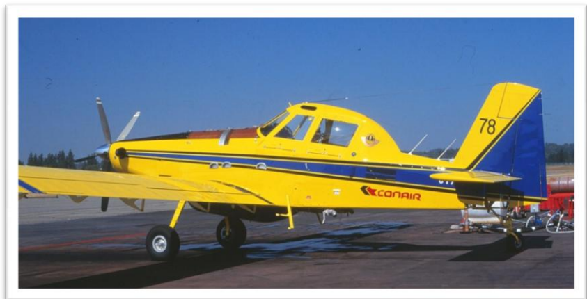
Figure 56: AT802F Tanker 78 Abbotsford August 1997

Fire numbers for the next two seasons were half of the 10 year average. In 1997 Conair proposed substituting two Firecats with a pair of Air Tractor 802F's for trial. The turboprop 802 has a constant flow 3025 (666 imp. gal.) tank. It's performance allowed it to operate from shorter airstrips where it could work with mobile retardant bases. Tankers 78 and 79 joined the two Kamloops Firecats that season and the 802s also worked from the Lillooet forward base in early August.