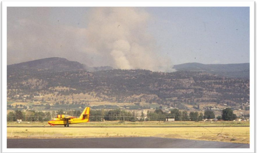
Figure 53: Ontario CL215 T262 departs Penticton for action on the Garnet fire (in the early stages) late July 1994

In early July of 1993, flight tests were undertaken with a Govt. Air Services Cessna Citation 550 twin jet. Results were very positive in the low level birddog role. By 1995 Airspray had proposed the use of their company Citation 500 for use with Tanker 88 in the Prince George Region. Initial concerns regarding single pilot operation and ingestion of smoke into the turbofan engines were soon alleviated. The aircraft was introduced to the Air Attack crews at Williams Lake in late April of that year. Birddog 50 continued in the birddog role for a number of seasons in B.C.