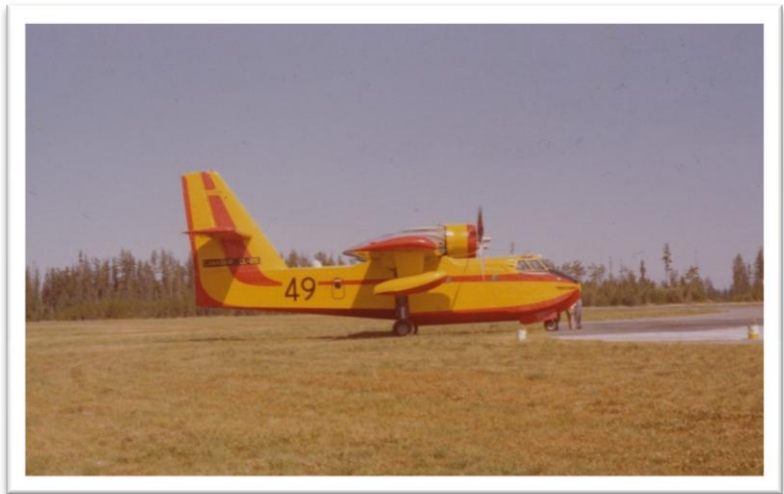
Figure 37: Tanker 49 C-GUKM at Williams Lk. Aug. 1977

Air tanker activity during the mid 1970's was below average to average with the provincial fleet consisting of A26 and DC6 types. A formal evaluation of the Canadair CL 215 water bomber was undertaken in 1977. This was to determine whether modern scooper aircraft could supplement or replace landbased tankers in certain areas of the province and reintroduce the "gallons per hour" suppressant delivery on fires. The evaluation took place between August 15 th and September 10 th . Tanker 49 C-GUKM worked 28 fire missions mainly in the Cariboo and Kamloops Districts. Results were mixed as the aircraft performed well in a support role but would likely be too expensive to supplement the existing land based fleet.