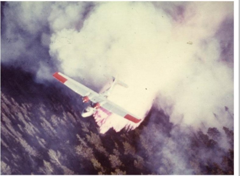
Figure 18: "Super" Canso #2 N609FF Nazko 1966