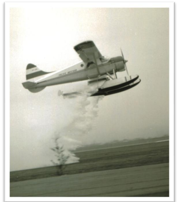
Figure 2: DHC2 Beaver "roll" tank drop. BC Archives NA-19703