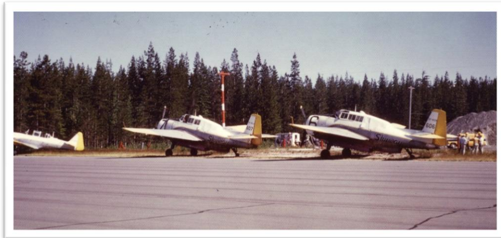
Figure 20: Harvard CF-NSN Birddog #1 with TBMs 606 and 607 - Terrace 1966

Skyway Air Services moved their main base from Langley to the much more spacious facility at the Abbotsford airport in 1965.