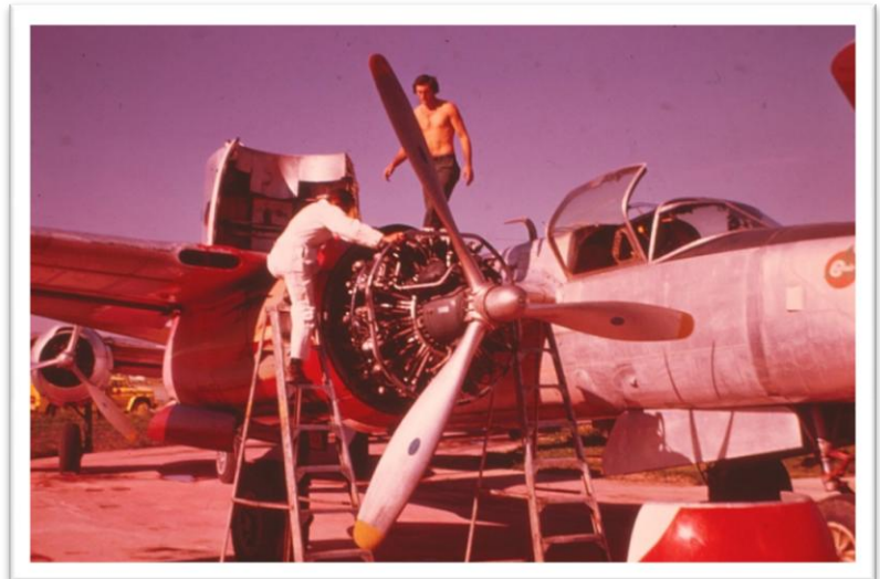
Figure 33: Another essential part of the team - an engineer works on an A26 engine circa 1974.

The TBM Avenger ended service in B.C. in 1975 after eighteen seasons. Conair would continue to search for a replacement for it, and ironically the A26, for future years.