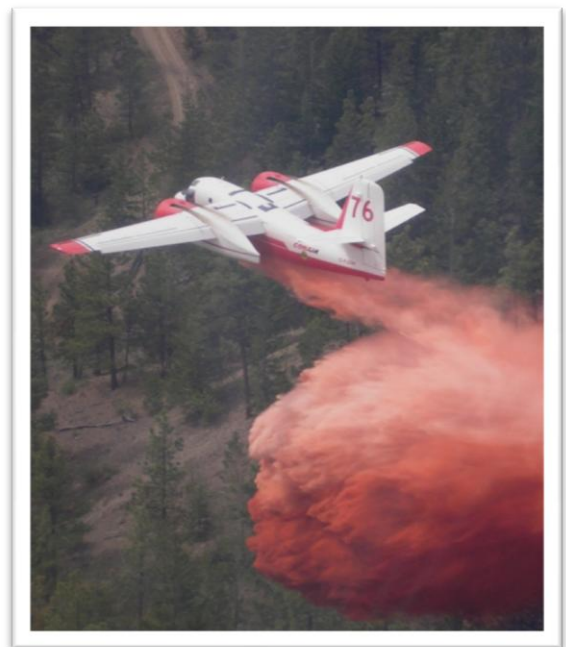
Figure 69: Firecat T76 drop Cariboo 2006