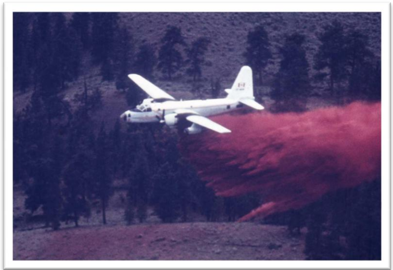
Figure 29: Neptune test drop Tranquille Creek near Kamloops - July 19th 1972