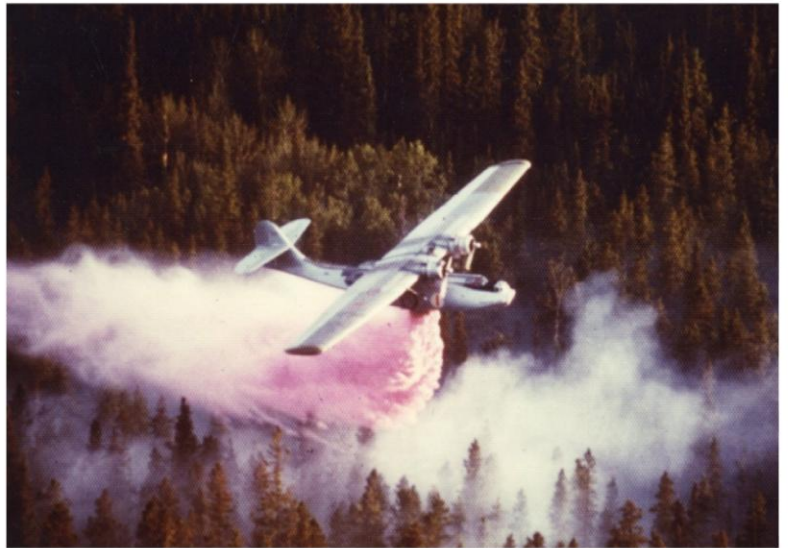
Figure 17: Canso #1 CF-NTL near Ootsa Lk. 1966

A Trans Provincial DHC 3 Otter equipped with a 225 gallon internal tank also operated from Prince George during these seasons.