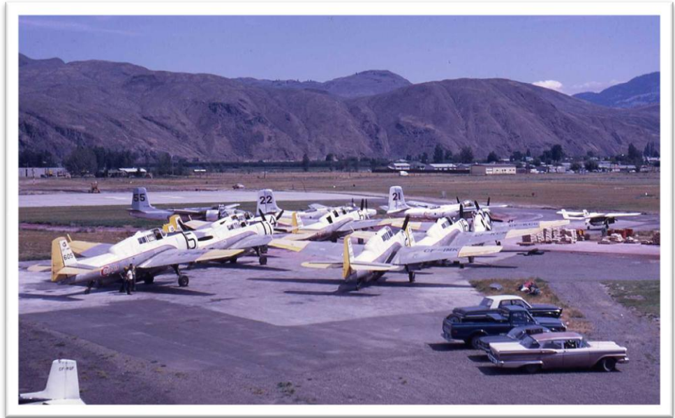
Figure 26: T21, T22 and T55 join 7 TBMs at Kamloops July 1970

1970 accounted for over 4000 fires, a record number up to that time. Originally destined for Prince George, the A26 group included Tankers 21 and 22 acquired from Aero Union of Chico California and Tanker 55 leased from Aero Union. They spent most of the season operating from Kamloops and Kelowna and worked over 200 targets for just under a combined total of 600 flight hours (which is rather fine for a first year). By 1971 Conair had deployed five A26s: a group of 3 in Prince George and a pair working part of the season in the Yukon.