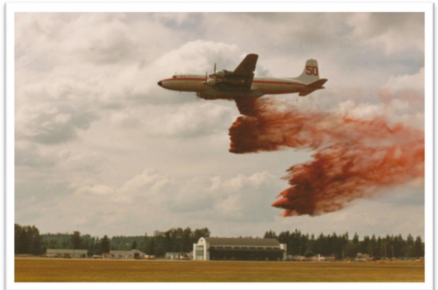
Figure 40: Tanker 50 demonstrating the 12 door tank at Abbotsford 1983

In 1983 Conair introduced the 12 door microcomputer controlled DC6 tank. Providing the same volume as the original 8 door version, the 12 door system delivered a more than 200 % improvement in retardant line lengths at lower coverage levels. The tank was fitted to Tanker 50 and operated in Kamloops that season. The majority of the company's DC6s were eventually fitted with this system.