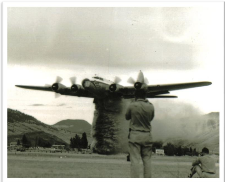
Figure 8: Biegert Bros. B17 N17W at Kamloops August 1960. This aircraft has been restored to military configuration and is currently on display at the Boeing Museum of Flight in Seattle Wash.

With the addition of the land-based (wheeled) tankers, managers introduced Bentonite clay to the bombing arsenal. Pits were dug from the ground and bags of clay were mixed with water by injector type mixers at a ratio of one pound of clay to one gallon of water. Separate pumps were used to load the "slurry" into the aircraft.