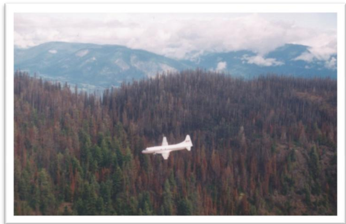
Figure 62: CV 580 flight testing over the recently burned Mt. Ida near Salmon Arm - Sept. 10th 1999

The introduction of the Convair 580 into B.C.'s fleet in 2000 solidified the province's aircraft types for the next decade and beyond. Tankers T44 and T55 were online that summer and provided assistance in a busy period in the Southeast. Ownership of Electra T 53 transferred to Airspray in March and assisted there as well, now as T87 - still with the compartmented tank.