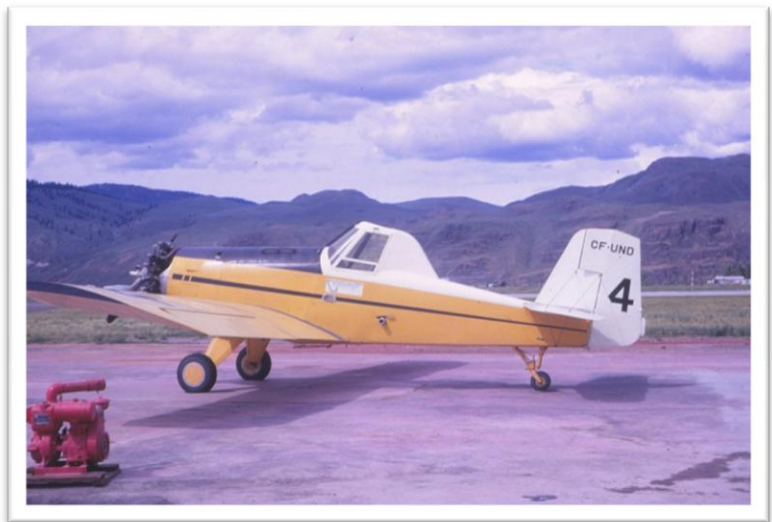
Figure 24: Mercury Flights Snow Commander Tanker 4 - Kamloops May 1969