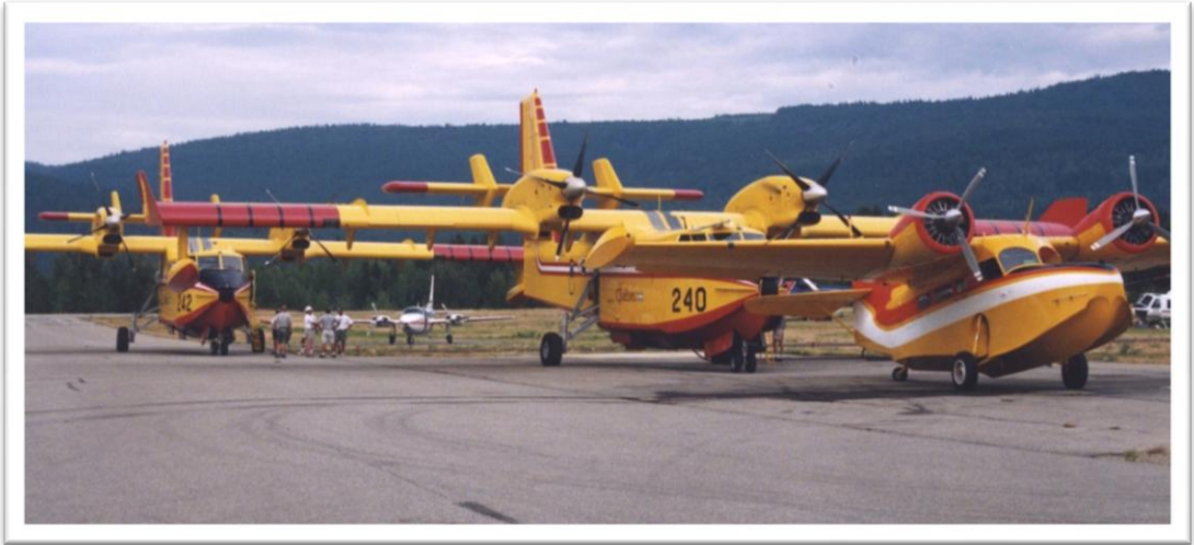
Figure 58: CL415's T240 & T242 with Aerostar birddog 21 and F.I.F.T. Grumman Goose birddog C-FVFU - August 3 rd 1998, Salmon Arm Airport

Hawaii Mars LYL flew an additional 120 hours providing support on several fires in the Kamloops and Salmon Arm area. 1998 was to be the last season for the DC6 contract in B.C.