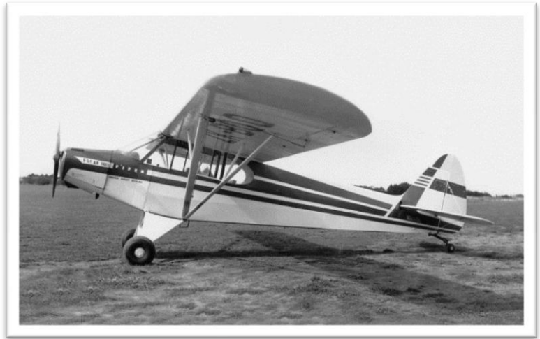
Figure 10: Piper PA18 Super Cub birddog

1960 was to be the first year using a “birddog” aircraft and “Birddog Officer” in B.C. (and possibly Canada). While not physically directing each bombing run, the birddog crew would recce fires and set priorities for attack. Up until that season bombing success relied on pilot discretion or direction from the ground if available or possible. The first aircraft to be used in this role was the Piper Super Cub.