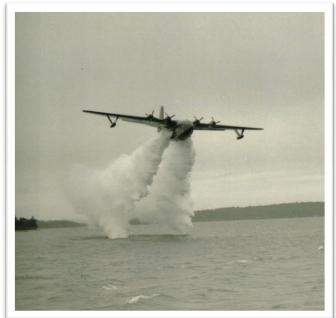
Figure 11: Marianas Mars CF-LYJ - drop trials at Pat Bay March 1960 - BC Archives NA-19806