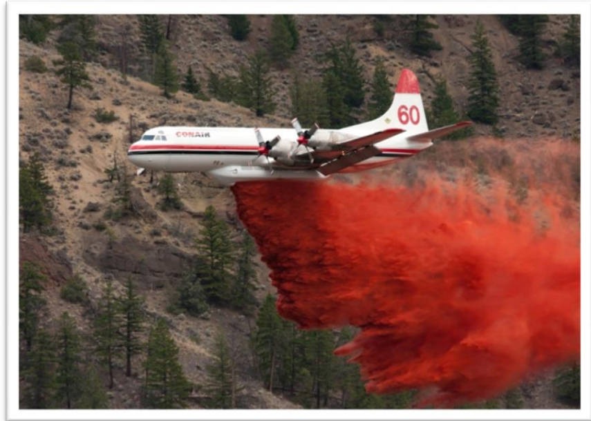
Figure 70: Conair L188 T460 with new RDS tank – Dewdrop Kamloops Sept. 2011

system also increased flow rates and retardant coverage levels.