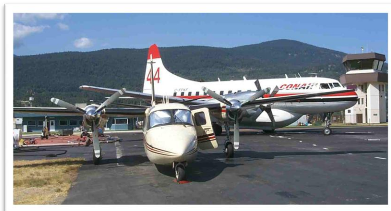
Figure 63: CV580 Tanker 44 and Airspray Birddog 51 - Castlegar Aug. 2000