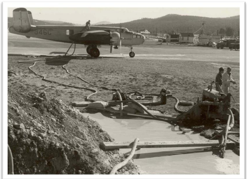
Figure 9: B25 Mitchell N7946C being loaded from a Bentonite "mud pit" at Cranbrook 1960. This aircraft has also been fully restored and is presently flown and displayed as "Old Glory" in the US.