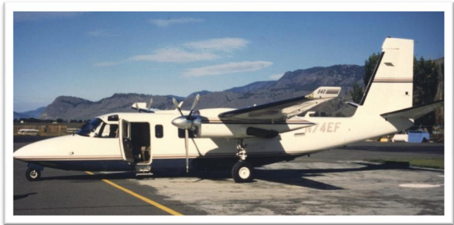
Figure 55: Jet Prop 840 at Kamloops Sept 19th 1995

Conair also introduced the Turbo Commander to the B.C.F.S. that season. In mid September a U.S. registered Jet Prop 840 was flown to Abbotsford and Kamloops for flight demonstrations in the birddog role. Similar to the Turbo Commander 690, the aircraft performed very well in the low level role with excellent cruise speed and visibility from the cockpit. Today the Commander 690 remains the backbone of B.C.'s birddog fleet.