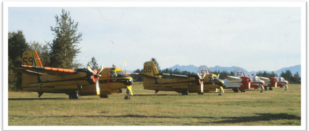
Figure 39: Tankers 62 and 63 at Abbotsford late summer 1980 - joined by OMNR T58 (later Conair T69) and T59 (later France's T1)

By 1980 Tanker 62 was joined by T63 and Conair was able to purchase the remaining Ontario Tracker fleet which were delivered to Abbotsford in the late summer. France's Sécurité Civile also placed orders for the Firecat and Conair delivered the first one (designated T1) in 1982.