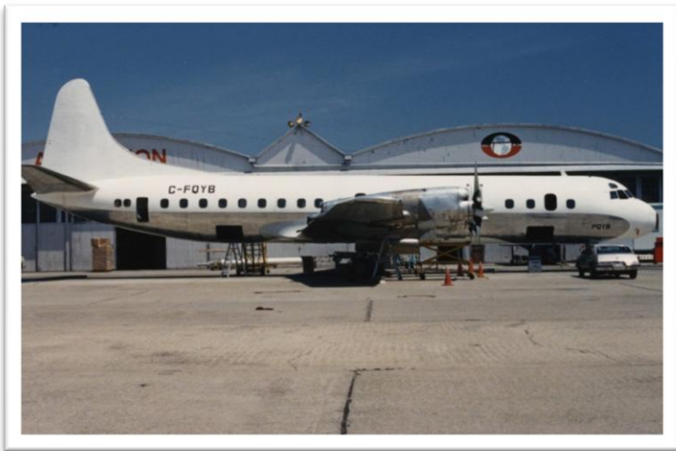
Figure 50: L188 C-FQYB conversion and tanking - Chico Calif. spring 1994