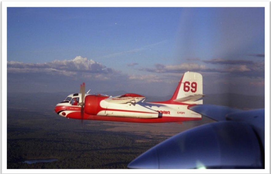
Figure 42: Firecat T69 over Douglas Lake piloted by Captain Al Kydd. (photo taken from Piper Aerostar birddog).

A number of events worth noting occurred in 1985. This was to be the 16 th and last season of use for the A26 in B.C and also the Cessna 210 birddog. A spare group of three A26s operated in the south of the province during an extremely busy season. This year also saw the introduction of the advanced Firecat retardant tank. The new tank was free of many of the internal obstructions of the original system, allowing a smoother drop pattern and, like the newer DC6 tank, door sequences were also computer controlled giving a multitude of different drop options to the Air Attack Officer. Tanker 69 was the first aircraft to be fitted with this system.