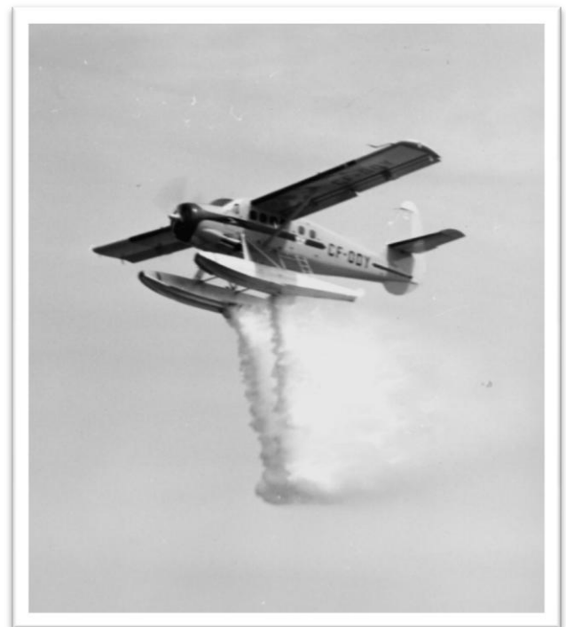
Figure 22: Ontario Air Services Otter with Field conversion float tanks totalling 210 gallons