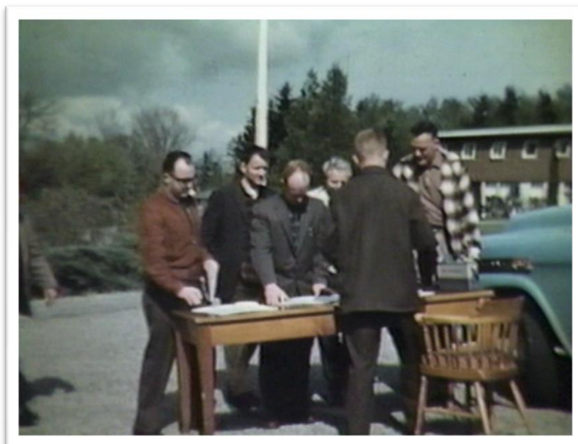
Figure 15: Birddog School trainees being briefed at the Green Timbers facility spring 1962