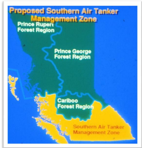
Figure 52: "South Zone" summer 1994

1994 was a busy season in the south part of the province, especially in the Kamloops and Nelson Regions. One innovation that season was the establishment of centralized air tanker dispatch for the southern three regions of B.C. The "South Zone", headquartered at the Kamloops Tanker Base, took advantage of improved communications and the introduction of computerized resource tracking for air tanker and birddog aircraft. In addition to landbased tankers, CL215's from Ontario, CL215's /215T's from Quebec and the Martin Mars were brought on line to assist. The centralized air tanker dispatch concept was a success and the next season it encompassed the entire province.