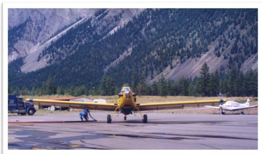
Figure 57: 802 Tanker 79 Lillooet Forward Air Tanker Base August 1997

The AT802 continues to be a part of the provincial fleet today.