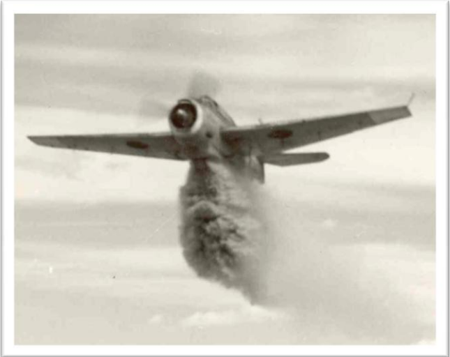
Figure 4: Skyway Air Services TBM-3E Avenger Tanker 601

Due to the success of the operations in 1958, by the spring of 1959 operators had equipped up to 18 aircraft with firebombing tanking systems including 5 Beavers, 5 Avengers, 5 Stearman, 2 Junkers and 1 Husky.