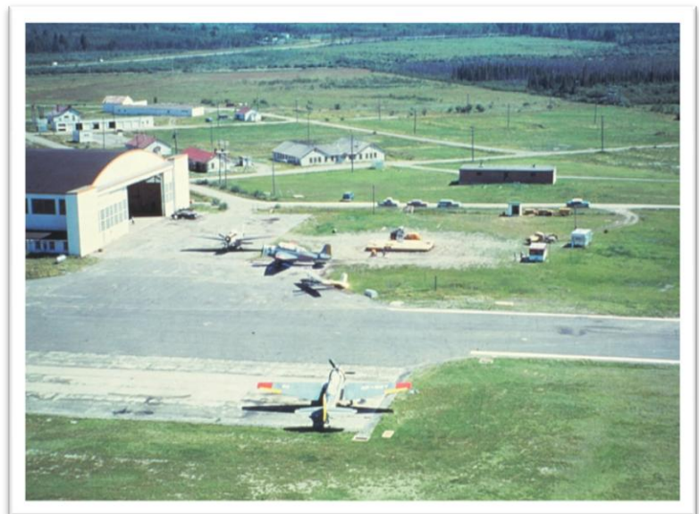
Figure 14: 3 contract Avengers and Cessna 180 birddog - Prince George Tanker Base 1962

1962 was certainly a pivotal season with the program. The British Columbia Forest Service entered into the first firebombing contract with Skyway Air Services. This was for the provision of 12 Avengers and 4 birddogs to be based equally at Smithers, Prince George, Kamloops and Cranbrook. The Avenger could carry a 500 gallon load and cruise at 160 knots. Paradoxically the fire season throughout the province was very light and allowed Districts to focus on bases, equipment and organization. The contract tankers and birddogs flew just over 500 hours provincially.