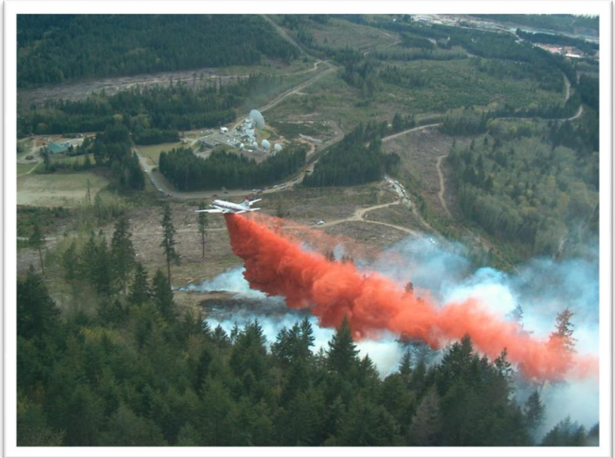
Figure 67: Conair CV580 Tanker 54 containing a fire near a satellite communications site at Lake Cowichan - April 2004

At the peak of the season 39 aircraft were operational in a firebombing role in the province. As a result, the B.C.F.S. was able to supplement the contracted fleet with an additional two CV580's and birddog in 2004. Air tankers from Ontario, New Brunswick, Alberta and Quebec also assisted in B.C. that season. With the exception of 2006, the next several years were relatively quiet. The B.C. fleet configuration remained the same through 2009. That year was the final one for the contracted Firecats which served the province admirably for three decades. The six aircraft were replaced by an Electra and two AT802's in 2010.