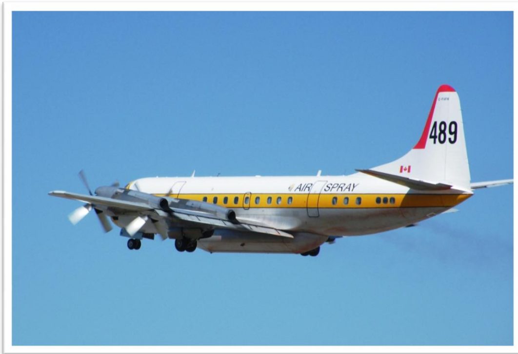
Figure 72: Airspray's Electra T89 departs Penticton for a target to the north - Sept. 10th 2011

The 2011 season was one of the quietest in history. The Provincial Air Tanker Centre may have set a record with the number of air tanker practices conducted during the season. Activity did pick up somewhat in early September in the Southern Interior.