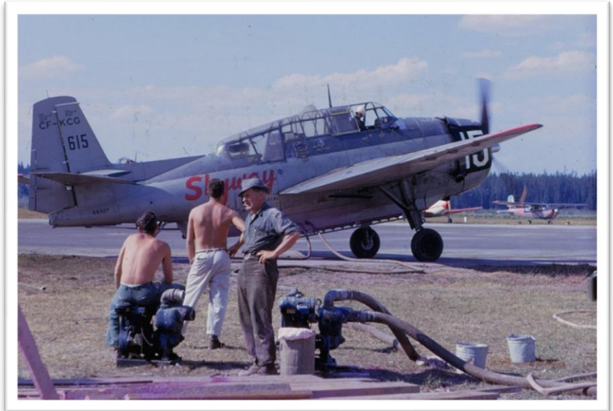
Figure 13: An essential part of the team - Mixer / Loaders and Mixmaster load Skyway Tanker 615 at Prince George August 1961. This aircraft was later restored and is on display at the Imperial War Museum in Duxford England.

On June 23 rd , while actioning a fire 20 miles west of Nanaimo, the Marianas Mars collided with trees and crashed killing all 4 crew members. Once it was determined that the cause was not with the aircraft or its systems, the Mars program was continued.