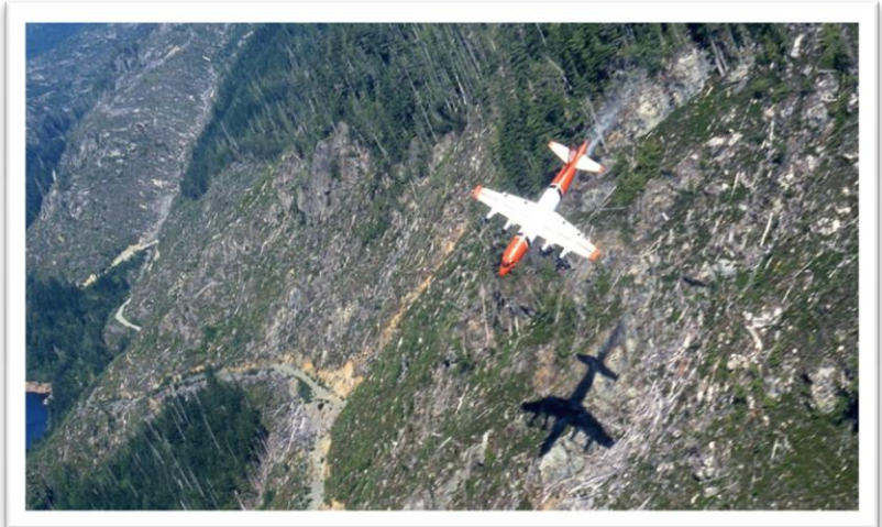
Figure 49: Wringing it out - Tanker 25 flight evaluation Jordan River Sept. 5th 1993

The P3 was introduced to Air Operations staff across the province in conjunction with the continuing evaluation. Results of the evaluation were very positive with respect to performance and flight characteristics in the low level role in British Columbia. The Electra program continued with Alberta Based Airspray 1967 Ltd. into 1994. Conversion and tank development was done by Aero Union at Chico in the spring and the Tanker 88 was operationally ready in Prince George in early July with an Aerostar birddog.