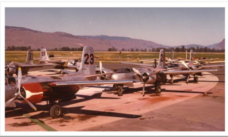
Figure 35: A large group of A26's at the new Kamloops Tanker Base - 1974