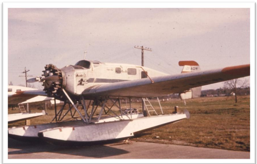
Figure 7: Skyway Junkers 34 CF-AQW at Fairey Aviation in Victoria awaiting conversion Spring 1959