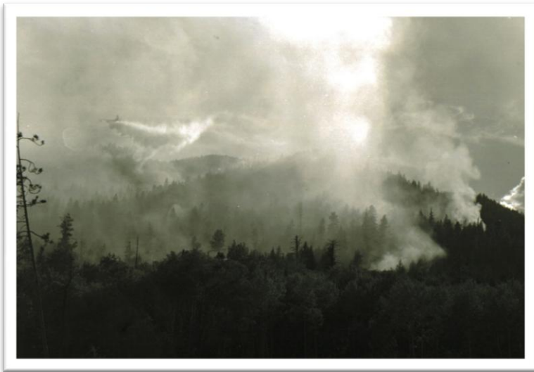
Figure 12: Marianas Mars dropping on Dean fire 1960

On the forest industry front, a consortium of 5 logging companies headed by MacMillan Bloedel purchased 4 military surplus Martin JRM Mars aircraft in California to be operated as giant water bombers under the company “Forest Industries Flying Tankers” (F.I.F.T.). The aircraft were flown to Vancouver Island in August and September of 1959 and conversion work completed on the Marianas Mars CF-LYJ over the winter by Fairey Aviation. This Mars worked on the 13,000 acre Dean Fire near Merritt in 1960.