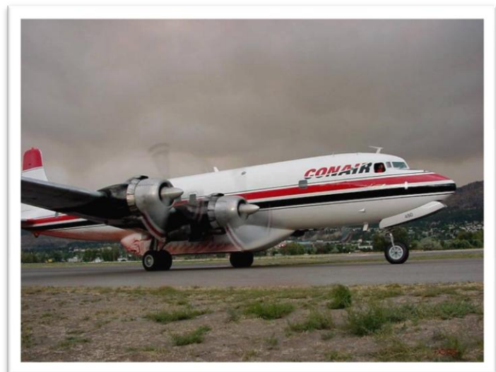
Figure 65: Yukon DC6 Tanker 50 - Penticton 2003