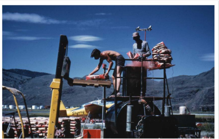
Figure 23: Crewmen mixing bags of Firetrol retardant with a 500 gallon "batch mixer" - Kamloops 1968

1969 was interesting on a number of fronts. The air tanker component of Skyway Air Services became Conair Aviation Ltd. at the end of April. The company would work closely with the B.C.F.S. to find suitable aircraft to supplement the TBM. Two Snow Commanders were trialed briefly in May but found to be too slow with insufficient payload. Three Douglas A26's were evaluated at Kamloops for a 12 day period in June. Despite the project being curtailed by weather, the aircraft worked on 30 fires and results were positive.