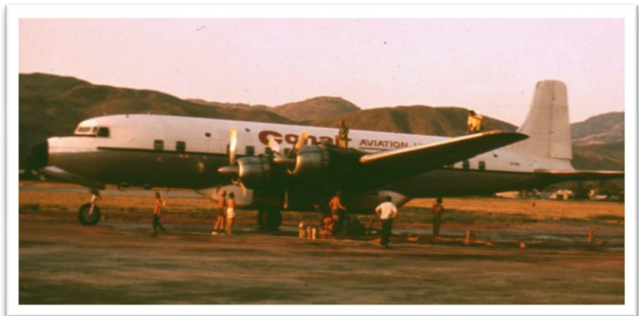
Figure 31: DC-6 CF-PWA Tanker 41 at Kamloops 1973