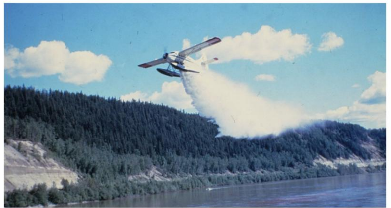
Figure 19: Trans Provincial Otter demonstration drop 1966