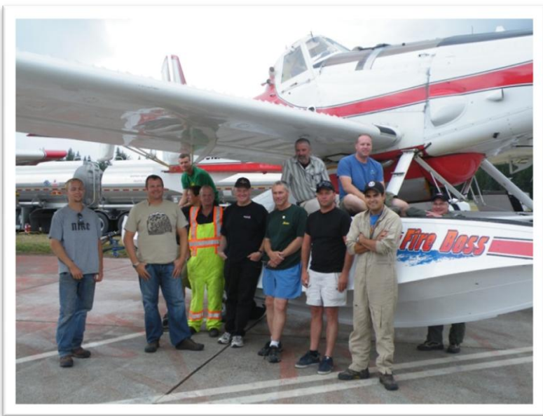
Figure 68: Alberta AT802 Fireboss crew at Quesnel Aug. 2009