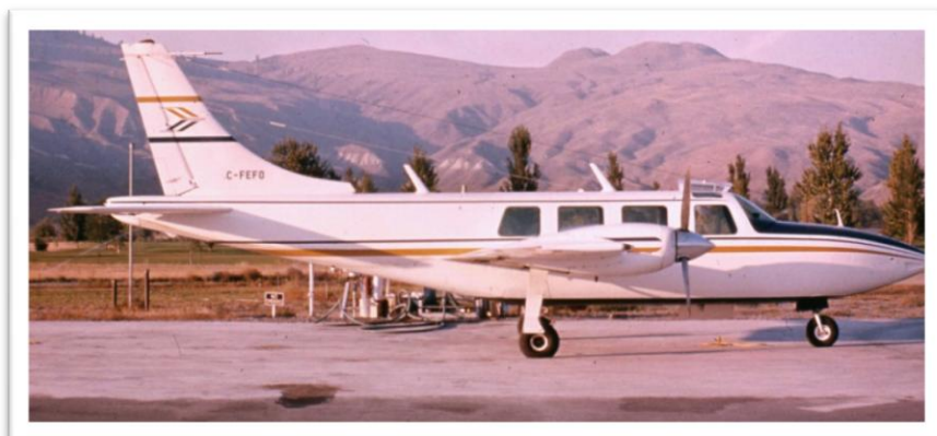
Figure 32: Piper Aerostar C-FEFO Birddog 3