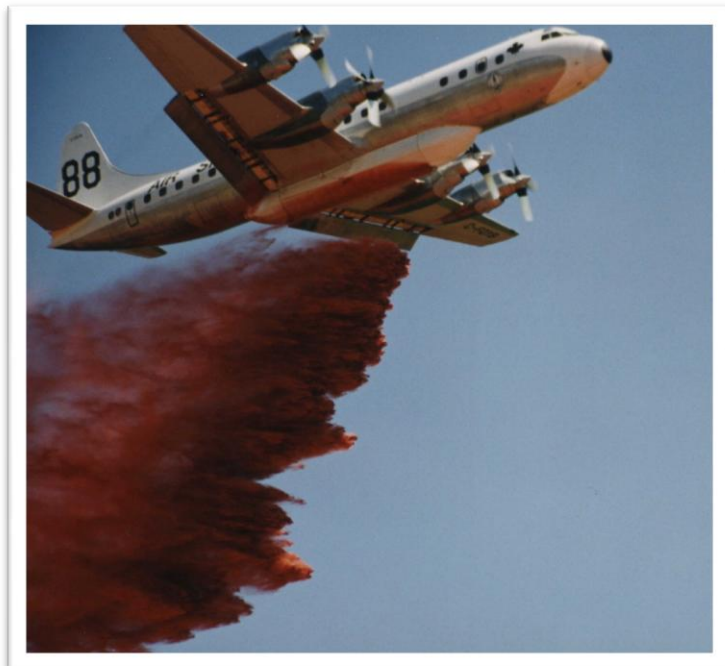
Figure 51: Prototype Tanker 88 drop grid tests at Yuba California