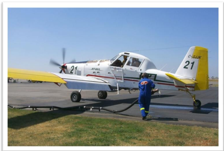
Figure 64: New Brunswick F.P.L. AT802 Tanker 21 being loaded at Abbotsford July 2002

One new tanker type was trialed that year. The amphibious Air Tractor 802 Fireboss was introduced in mid-July and worked mainly in the Revelstoke / Kamloops area in the landbased retardant and scooper roles.