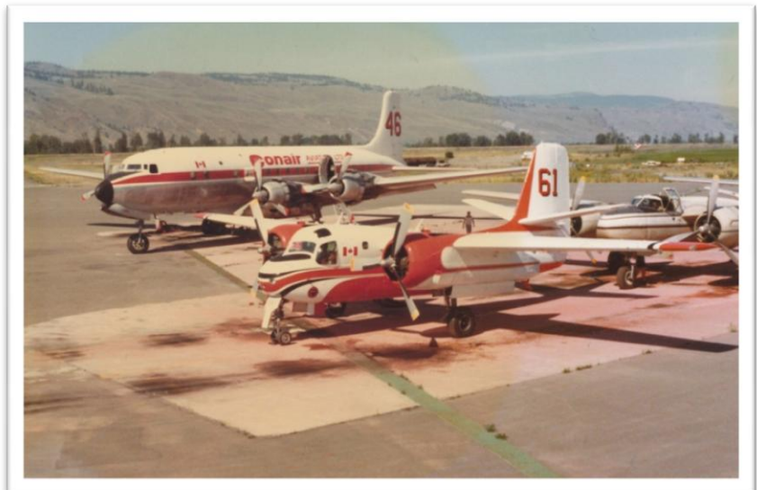
Figure 38: Firecat Tanker 61 C-GHQZ with DC6 T46 and A26 T32 at Kamloops summer 1978

By the mid 1970's Conair was looking for a replacement tanker that would be as manoeuvrable as the TBM with a payload comparable to the A26. At this point we have to back up a bit. In the fall of 1970 the Ontario Dept. of Lands and Forests purchased an ex-military DeHavilland (Grumman) CS2F Tracker for use as an air tanker. Working with Field Aviation and DeHavilland, Air Services completed the conversion over the next year. In November the next year the newly converted Tracker was demonstrated for the