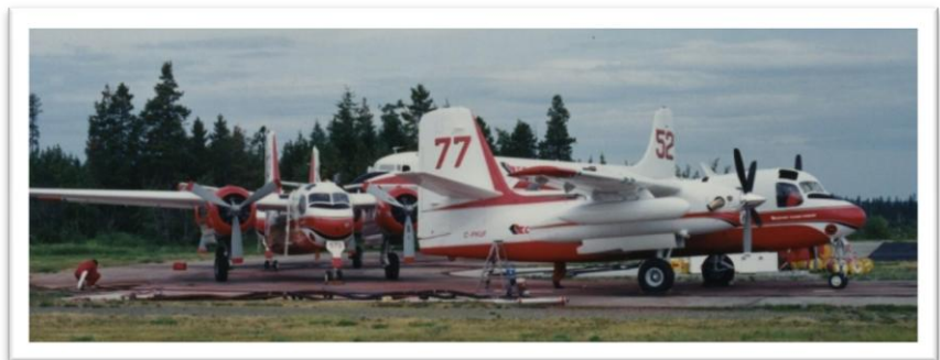
Figure 45: "Turbocat" T77 at Williams Lake August 1992

the Turbo Firecat was received in late winter of 1991. An operational trial of Turbo Firecat C-FKUF (Tanker 77) took place in the Cariboo in July and August of 1992. Despite improved flight performance over the piston model, the type was not produced for use in B.C.