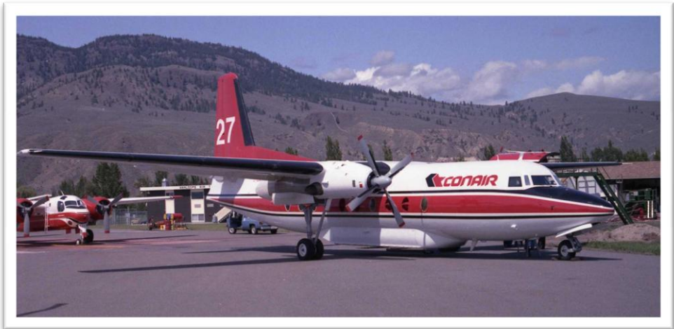
Figure 43: Tanker 27 at Kamloops July 30th 1986

Certified in 1986, Conair's Fokker F27 Firefighter (Tanker 27) was soon available for operational trials in B.C. With a cruise speed of over 225 knots, the twin engine turboprop aircraft carried an eight door 6730 litre (1400 imp. gal.) tank with the microcomputer door control system. The aircraft arrived in the field at the end of July. It was, unfortunately, a very slow season but the aircraft did work on 38 fires with mixed results. The type did not see further action in B.C. and later began operations in France with the Sécurité Civile.