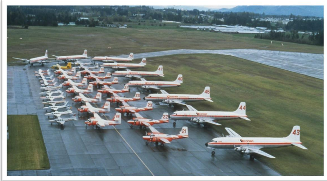
Figure 41: Conair's air tanker and birddog fleet at Abbotsford 1983 - providing services to British Columbia, Northwest Territories and Alberta

A number of events worth noting occurred in 1985. This was to be the 16 th and last season of use for the A26 in B.C and also the Cessna 210 birddog. A spare group of three A26s operated in the south of the province during an extremely busy season. This year also saw the introduction of the advanced Firecat retardant tank. The new tank was free of many of the internal obstructions of the original system, allowing a smoother drop pattern and, like the newer DC6 tank, door sequences were also computer controlled giving a multitude of different drop options to the Air Attack Officer. Tanker 69 was the first aircraft to be fitted with this system.