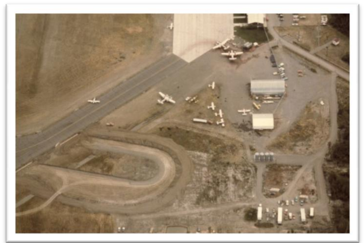
Figure 36: Construction of the new Williams Lake Tanker Base (old base at the top of the photo) - 1974