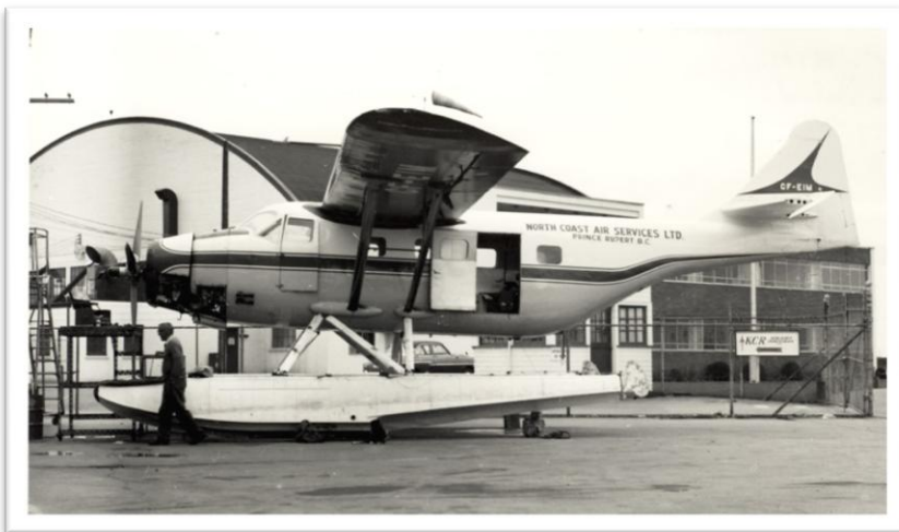
Figure 3: Fairchild Husky F11 registration CF-EIM operated by North Coast Air Services. This is the same aircraft that was earlier tanked in 1958