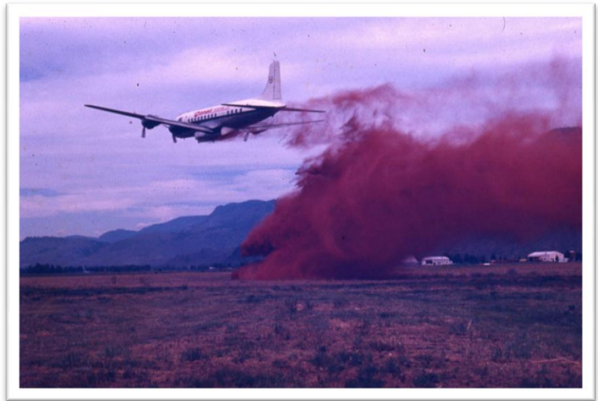
Figure 30: DC-6 CF-PWF drop demonstration at Kamloops August 9th 1972

the northern part of the province. The Ted Smith Aerostar 600 (later Piper), based in Prince George, was a fast mid-wing aircraft with excellent visibility from the cockpit. Able to match the speeds of the faster tanker types, this solved the longstanding problem of the long fire dispatches. As of this writing the Aerostar is still in use, making it the longest serving contract aircraft type in the history of firebombing in British Columbia at 39 years.