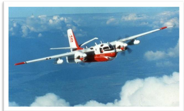
Figure 44: Flight trials Turbo Firecat T16

Let's back up again..... In August of 1987 Conair won a proposal with Sécurité Civile for the development of a turboprop Firecat. The aircraft was soon delivered from France to Conair and work continued throughout the winter. The prototype Turbo Firecat (T 16) was first flown in August of 1988 and delivered to France toward the end of the month. This led to a program to convert the entire fleet of Sécurité Civile Firecats. Back in Canada final Transport Canada certification of