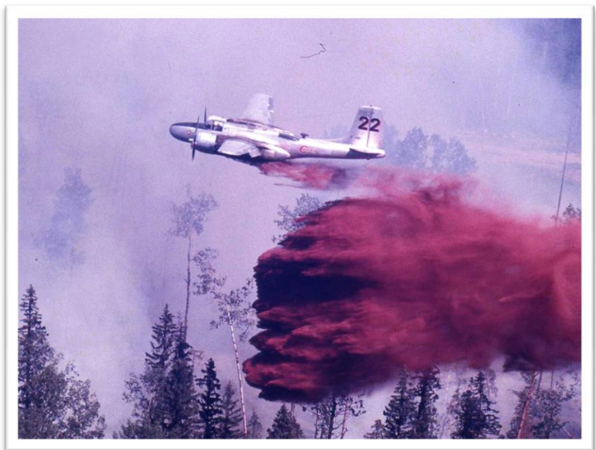
Figure 27: Douglas A26 registration CF-BMS Tanker 22 during the summer of 1970 piloted by Al Mehlhaff. T22 was delivered to the B.C. Aviation Museum in Victoria in 1989 and is currently on display there.