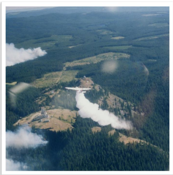
Figure 60: Hawaii Mars LYL drops on the top of Greenstone Mt. near Kamloops protecting a host of communication towers and equipment - August 5th 1998