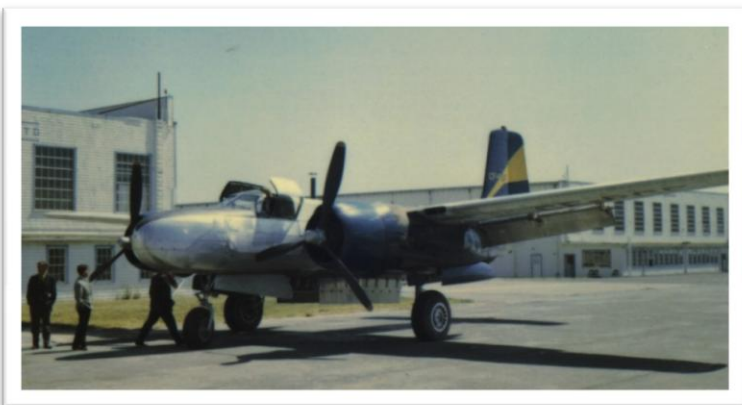
Figure 25: A26 CF-PGF displayed at Victoria 1969