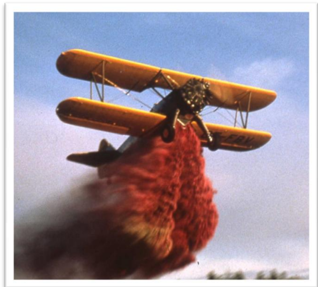
Figure 5: Skyway Air Services Boeing A75N1 Stearman