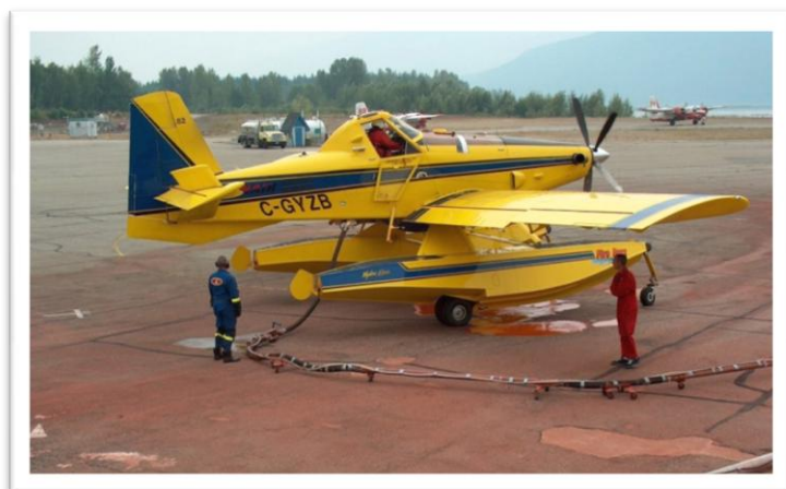
Figure 66: Fireboss Tanker 82 loading at Revelstoke Aug. 19th 2003