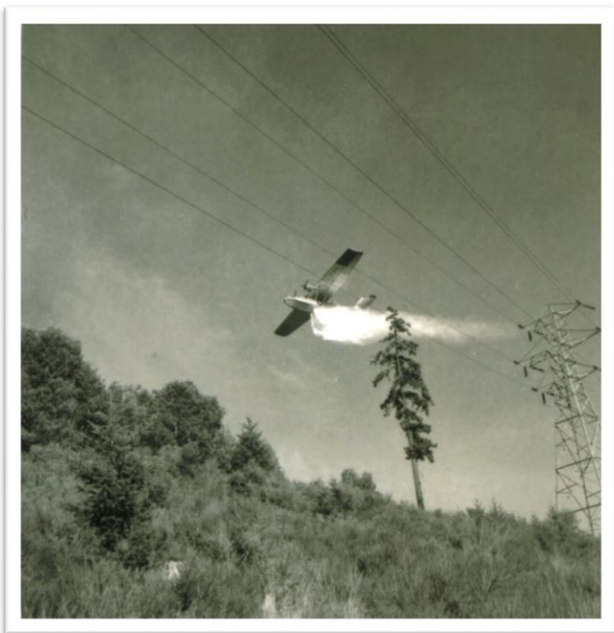
Figure 21: Canso tanker #3 working a fire over the Malahat on Vancouver Island 1967

The 1967 season was the heaviest for the use of all aircraft to date with over 20,000 hours of flight time logged. Contracted Cansos and TBMs accounted for nearly 725 hours and non contract bombers over 3000 hours. The Cansos worked in all five Forest Districts. The non contract aircraft included three spare TBMs and two Ontario Air Services DHC 3 Otters with internal float tanks.