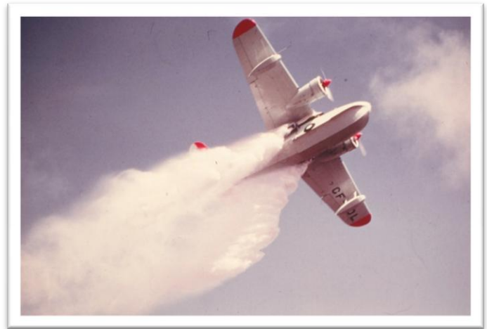
Figure 6: Grumman Goose CF-IOL "Dryad" May 1959