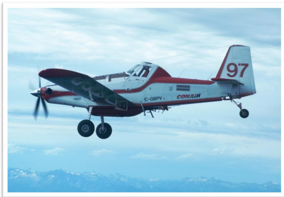
Figure 71: New generation AT802 T97 returning to Castlegar from a target near Cranbrook. Pilot Tom Zurowski at the helm – August 2011