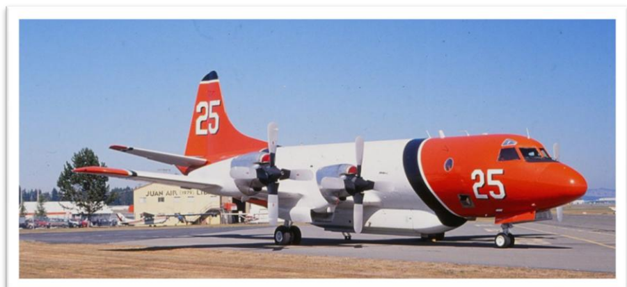
Figure 48: Aero Union P3 Tanker 25 at the Pat Bay Tanker Base Sept. 4th 1993