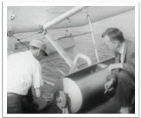
Figure 1: Demonstrating the Beaver "roll" tank system - summer 1958