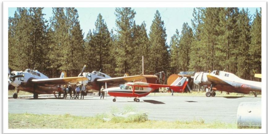
Figure 34: TBM group with Cessna 337 birddog - Grand Forks tanker base mid 1970's