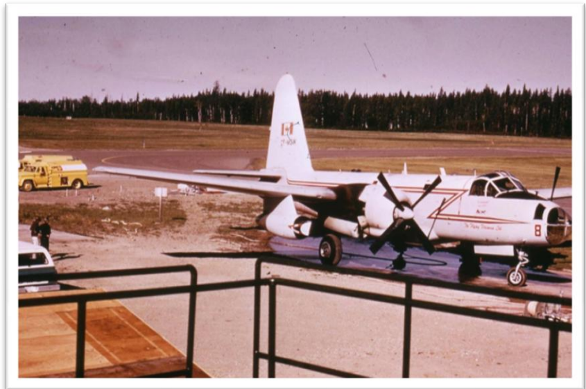
Figure 28: Neptune CF-MQW Tanker 8 at Prince George June 1972

Early that year Conair purchased two Douglas DC-6Bs formerly operated by Pacific Western Airlines. CF-PWA and CF-PWF were flown to Abbotsford in mid April and fitted with aerial spray equipment. They worked the month of May spraying spruce budworm in Quebec. Once they returned to Abbotsford PWF (later tanker 42) was flown to Chico California for conversion and fitted with an 8 door 2,500 imp. gallon firebombing tank. On it's return to B.C it underwent certification trials and performed a number of demonstrations including the Abbotsford Airshow.