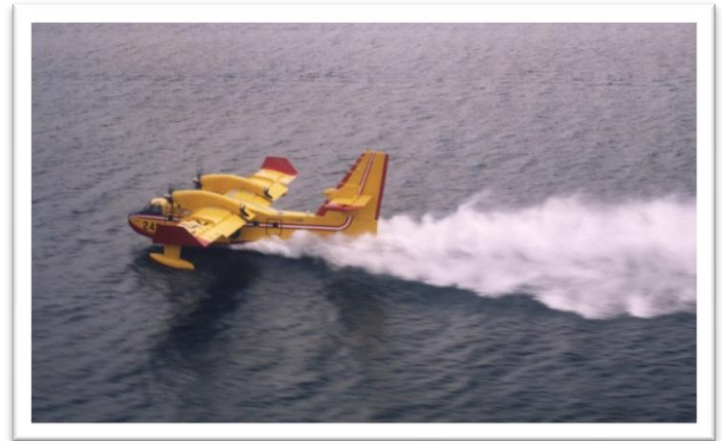
Figure 59: Tanker 242 "on the scoop" Shuswap Lake