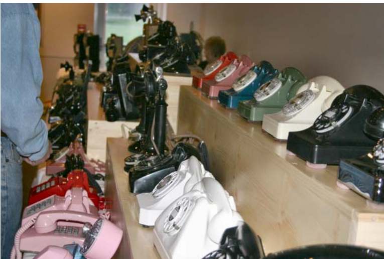
Don Woodbury's Display