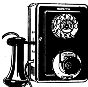
WALL TELEPHONE WITH DIAL

Save This Announcement. You will find it helpful in using the new system. We are publishing this advertisement, and asking your co-operation in order to make Norfolk's new telephone service a success from the start.