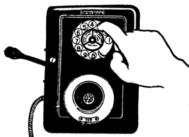
READY TO DIAL "3," THE FIRST FIGURE OF THE NUMBER GIVEN AS AN EXAMPLE

THE satisfaction derived from the new system at the outset depends largely on the readiness with which our subscribers and the public generally operate the dials. To make it certain that every one understands how to use the Automatic System, we make the following explanation. Every telephone user should study it carefully.