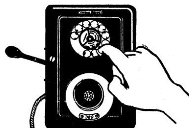
THE DIAL PULLED AROUND TO FINGER STOP

Remove The Receiver from the hook and listen for a steady, humming sound, known as the "dial tone." If you hear the dial tone, place your finger in the hole containing the first figure of the number to be called and pull the dial as far as it will go; then remove your finger and let the dial go back. Repeat this operation for each figure in the number. If you do not hear the dial tone hang the receiver on the hook and wait a few seconds before attempting to dial.