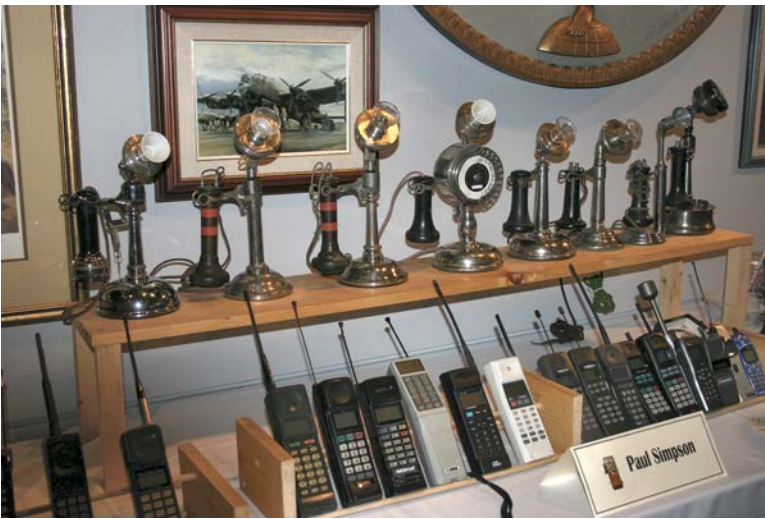
Paul Simpson's Display