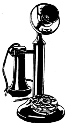
THE DESK TELEPHONE WITH DIAL