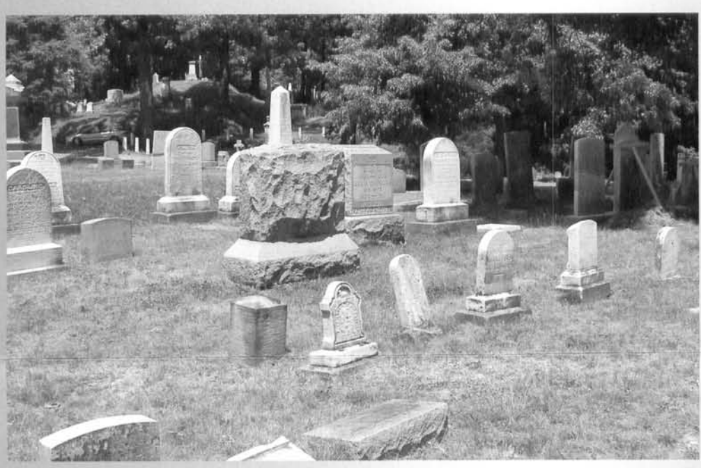
The first Jewish communal burial plot in Mount Hope Cemetery was established in 1848. It is in Section O.

Many other intriguing and inspiring stories were shared, offering all who attended a new appreciation of the rich history and important contributions of Rochester's Jewish community.