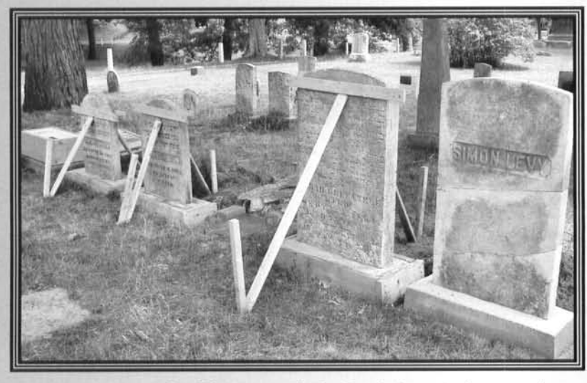
Many of the fallen stones in the first Jewish plot are in the process of being restored with new foundations.