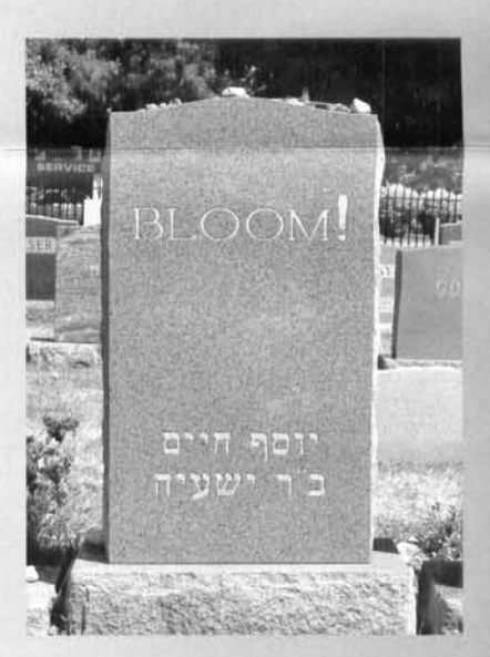
The reverse face features an exclamatory command, "Bloom!"