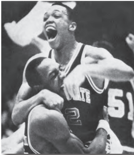
ROCKY TOP: The Panthers celebrate a stunning upset at Tennessee in 1983-84.

2/15 Southeastern Louisiana..... hL 63-73 2/21 @ Mercer..... aL 61-71 2/23 Middle Tennessee ..... hL 69-76